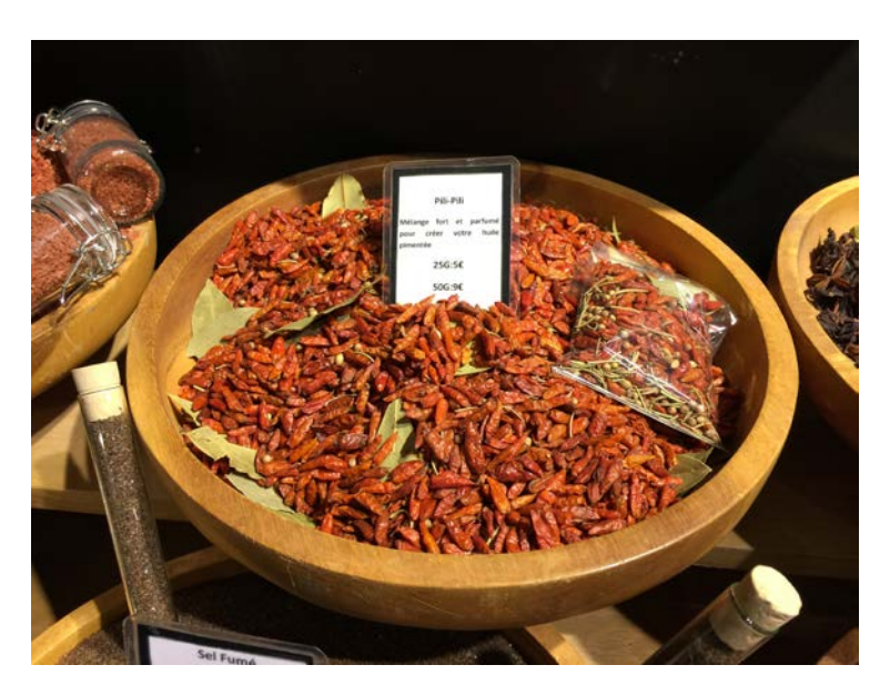
Figure 1. Different Pili-Pili pepper variety sold in a Paris-France market

Pepper is one of the most produced and consumed vegetables in the world. There are many different species and types of this vegetable originated from South America. The consumption of cultivated species and types of these species may vary by habits and cultures of countries. Rwandan pepper production was recorded as 4750 tonnes in 698 ha area in 2017 according to FAO (2017) database. Pili-Pili belonging to Capsicum chinense is one of well-known and popular pepper variety in Rwandan cuisine. After one of authors of this study visited French markets in Paris, we have realized that there are different Pili-Pili varieties in the world (Figure 1). Therefore, we have decided to name ours as "Rwandan Pili-Pili".