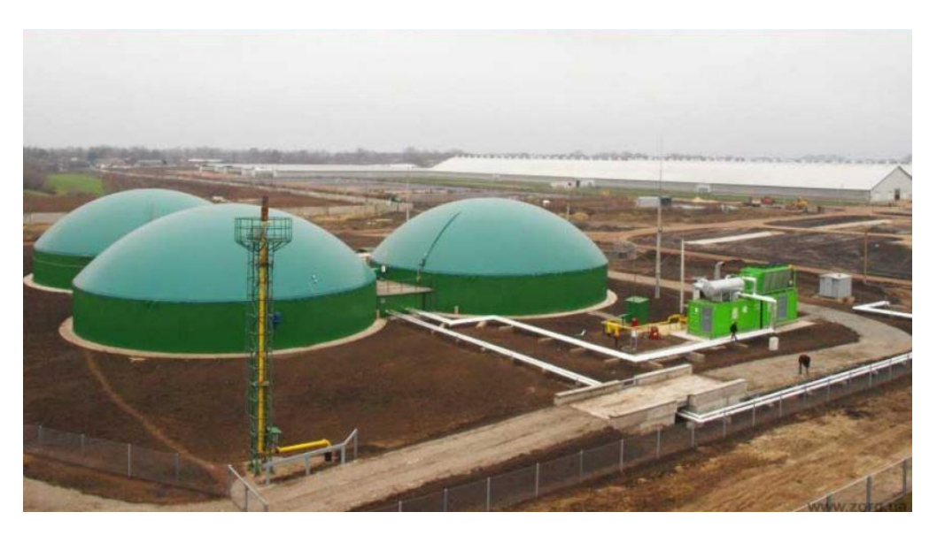
Figure 1. Farm type biogas plant