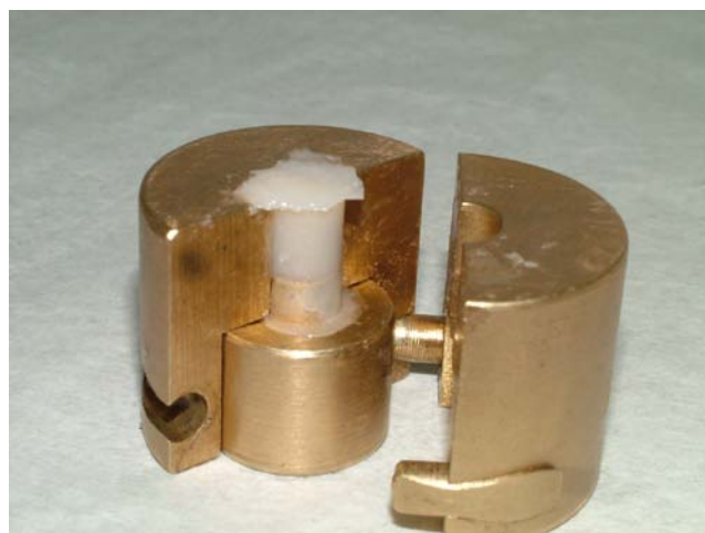
Figure 1. The use of brass mold, in order to obtain provisional crowns with all the same dimensions and shape.