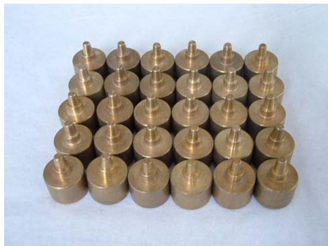
Figure 1. Brass dies with premolar dimensions were prepared with the aim of crown fabrication.

program. As the groups were independent and each contained fewer than 30 specimens, Student's t -test was used for statistical analysis.