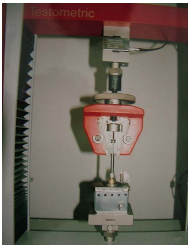
Figure 3. The specimens prepared were consecutively placed in a test measurement device (Testometric, Testometric Co., UK) for fracture testing.