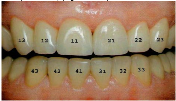
Fig.1 The formula of frontal teeth (according to WHO classification).

thresholds of teeth in female and male patients were demonstrated: in female it was lower than in male (about 31%) (Figure 2 A, B).