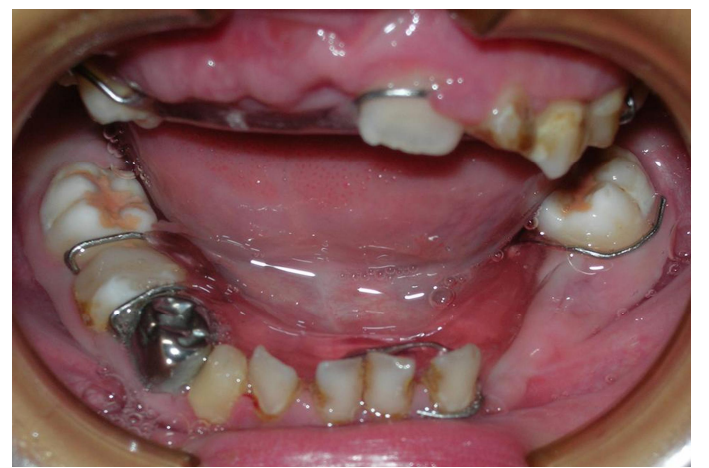
Fig. 3 Postoperative intraoral view of mandibula.

examination, a treatment plan was developed that included oral hygiene instructions, mechanical debridement, and periodontal reevaluation. The gingival health of the patient was improved with periodontal therapy. However, teeth 63, 64, 83 and 85 were restored with compomer (Dyract Extra; Dentsply, De Trey, Germany). Tooth 84 was restored, with stainless stell primary molar crown (Stainless Stell Primary Molar Crown; 3M ESPE, Seefeld, Germany) due to excessive structural loss. Fissure sealant (Fuji VII; GC Corporation, Tokyo, Japan) was applied for teeth 16, 55, 65, 26, 36 and 46. In order to prevent orthodontic anomalies connection with tooth absence and delayed of eruption teeth, the patient was treated with removable space maintainer (Figs. 3-4).