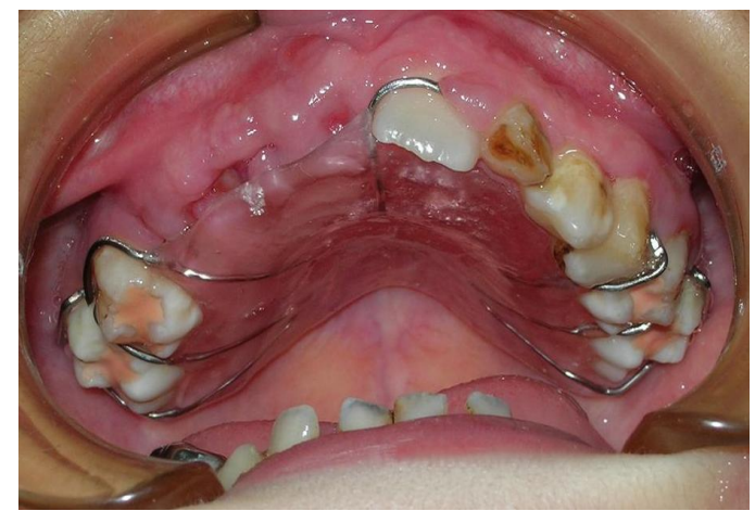
Fig. 4 Postoperative intraoral view of maxilla.