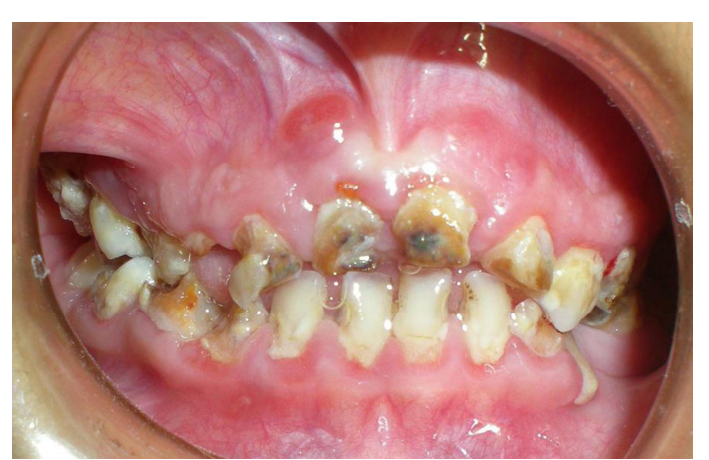
Fig.1 Preoperative intraoral view of teeth.