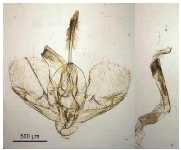
Figure 7. Male genitalia of Glyphodes pyloalis