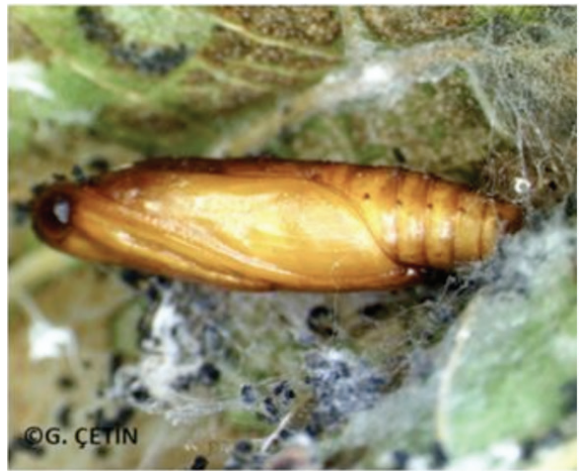
Figure 5. The pupal stage of Glyphodes pyloalis