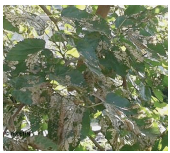
Figure 2. Mulberry leaves damaged by larvae of Glyphodes pyloalis