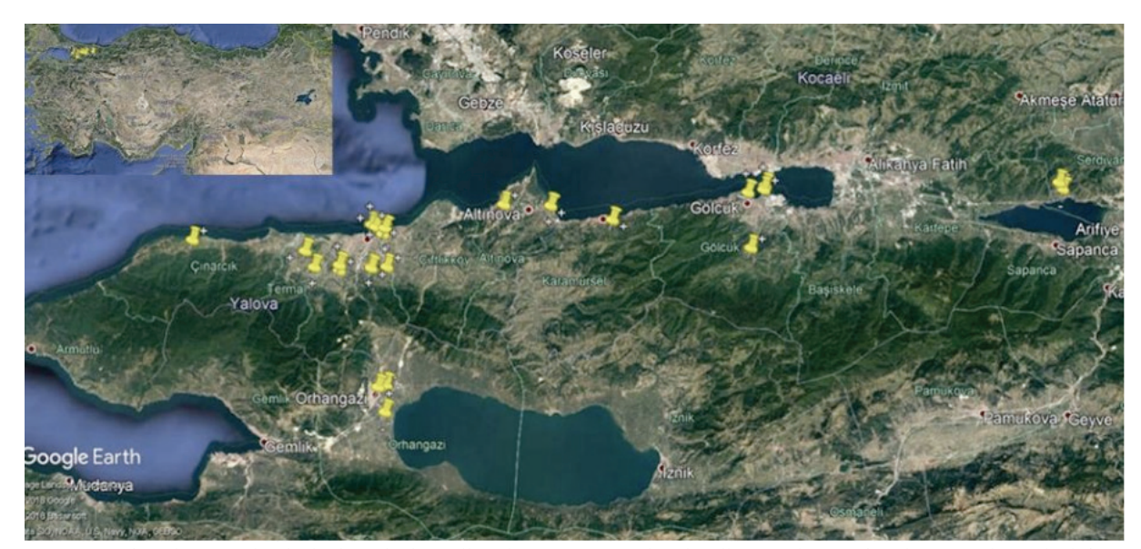
Figure 9. Infested area with Glyphodes pyloalis Walker (locations pinned with yellow) and map of Turkey (upside on the left)

According to Table 2 and Figure 9, the 16 locations out of a total of 20 mulberry cultivation areas of 8 districts belong to 3 different provinces were infested by G. pyloalis . However,