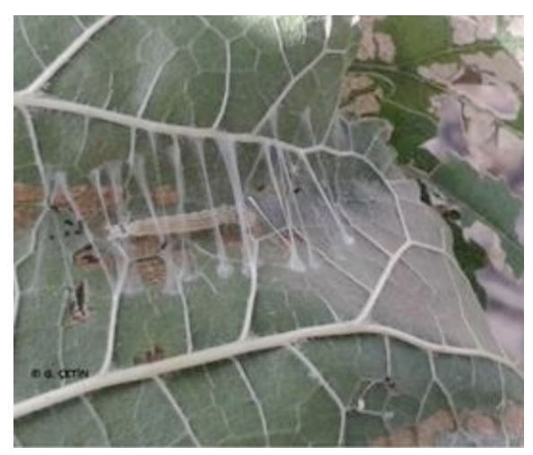
Figure 3. Third instar larval stage of Glyphodes pyloalis and strands formed by it