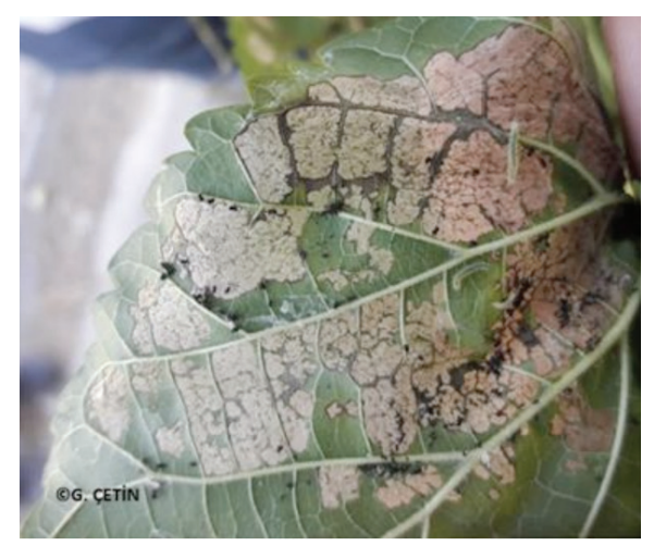
Figure 1. First and second instar larvae of Glyphodes pyloalis