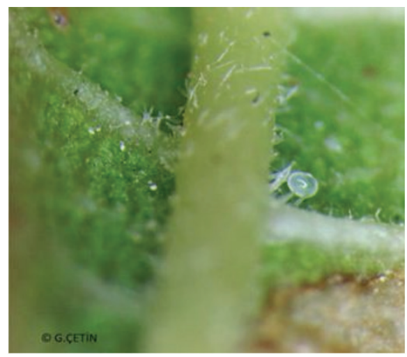
Figure 8. The egg of Glyphodes pyloalis