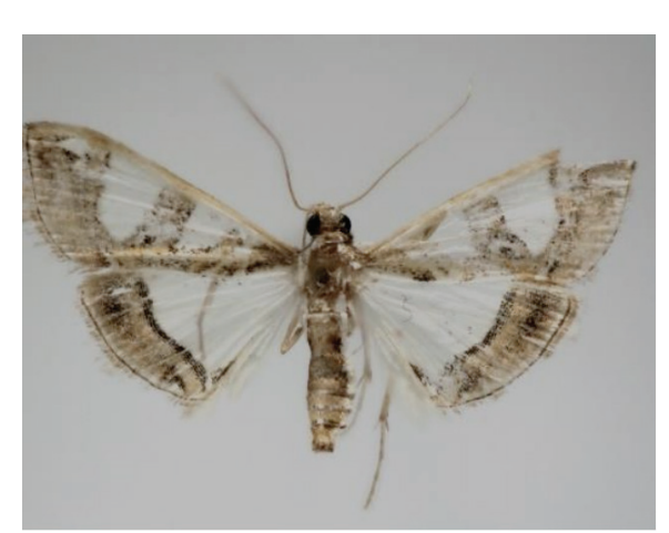
Figure 6. The adult of Glyphodes pyloalis

The first and second larval stages lasted seven days with 3-4 days intervals, and they were pale green. Afterward, the larvae feeding with the parenchyma tissue turned into a third and fourth larval stage with 4-5 days intervals. Finally, they became the full-grown larvae after 5-6 days and then transformed into pre-pupae in the case and pupae stage for 3-4 and 9-10 days, respectively. After all, adults appeared in the first week of August. This pest has 5-6 generations per year in Pakistan and varies the number of generations and some biological characteristics depending on environmental and climate conditions (Mathur 1980). Conclusion, the number of generations, durations of egg, larvae, pupae and adult stages belonging to every generation should be studied in detail in Turkey. In addition to these biological studies, the survey studies conducted on the spreading of pest and the obtained findings are given in Table 2 and Figure 9.