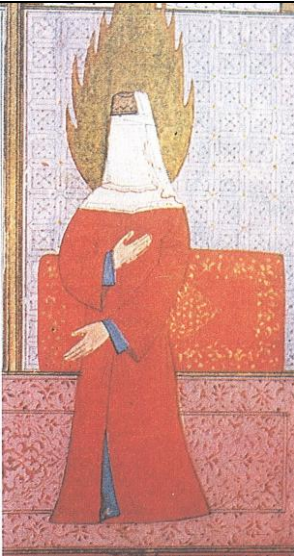
16 th century veil example by Siyer-i Nebi. ' den Topkapı Palace Museum Library. (Keskiner, Antik Dekor Dergisi 27, 1994, p.12)

Veil: A one-piece cloth completely covering the face (Keskiner, Antik Dekor Dergisi 27, 1994, p.119). Used outdoors, it is intended to obscure the face and provide anonymity.