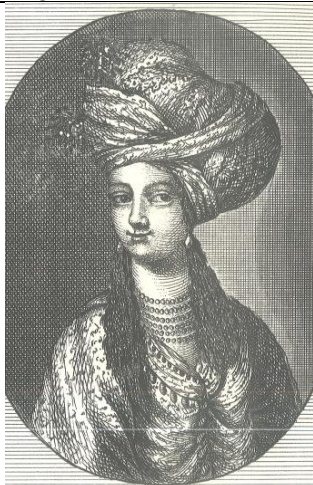
(Sevim, 2002, s. 142)

Sarık: The name for pieces of fabric wrapped on or around caps. A great variety of examples exist (Yeni 2009:245). Besides thin cotton or cheesecloth, hand-woven fabrics or valuable silks might also be used.