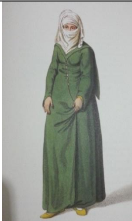
2012 facsimile of the 1802 London edition of the album. Lady wearing yashmak (Dalvimart, 2012, p. 63).

Yashmak: Veil consisting of two pieces of fine cotton or silk: one piece is tied across the forehead, the other draped across the face (Scarce's Women's Costume, An Overview of 16th Century Turkish dress, http://www.geocities.com/kagnate/ottocloth.html ) Two different types, the closed and open yashmak, existed, to respectively conceal or reveal the face.