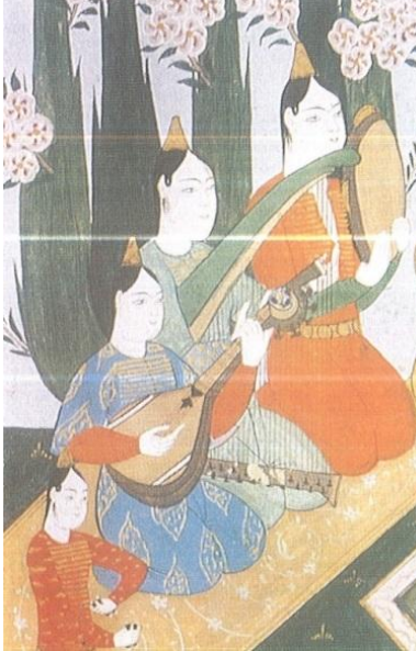
I.Ahmet Albümü Fesli hanımlar (Album of Ahmed I, Ladies Weraing Fez), 17th Century. Topkapı Palace Museum Library (Keskiner, Antik Dekor Dergisi 27, 1994, s.120).

Fez: The fez, a flat-crowned, cylindrical cap that is usually red and tasseled, is named after the Moroccan city of Fes. It can be small or large, and may also be in the shape of a of a conical, sometimes round-crowned cap (Sipahi, Çetin, 2010: 234).