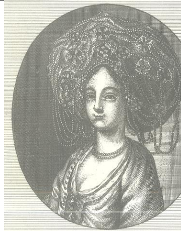
Woman Wearing Tarpuş (Sevim, 2002, p.151)