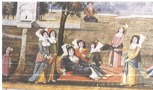
18 th century. Hübanname and Zenanname. Women wearing yashmaks. (Keskiner, Antik Dekor Dergisi 27, 1994, p.121).