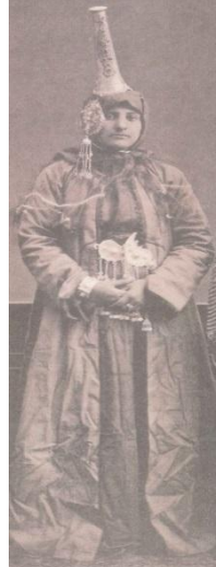
(Osman Hamdi bey, DeLaunay, 1999, p. 402)