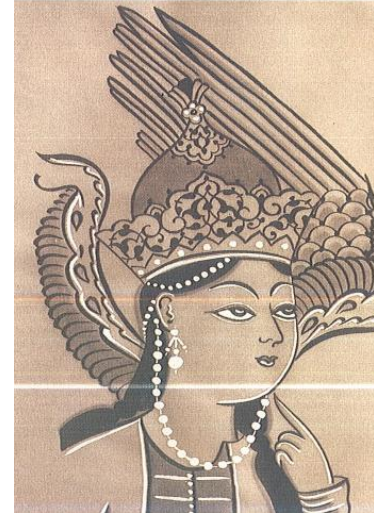
(Keskiner, Antik Dekor Dergisi 27, 1994, p.122).

Tantur: A narrow, horn-shaped cap placed above the forehead, decorated with gemstones or tied with a scarf ( Elbise-i Osmaniyye, 1999, p.392). The gems and workmanship would vary according to the wearer's income or social status.