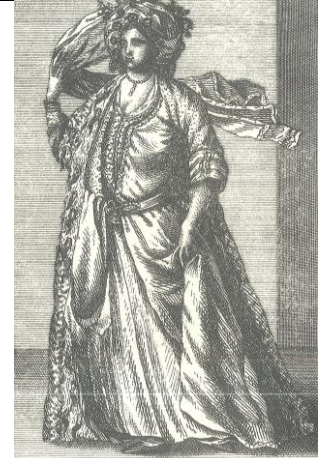
Woman Wearing Tarpuş (Sevim 2002, p. 149)

Yashmak: Veil consisting of two pieces of fine cotton or silk: one piece is tied across the forehead, the other draped across the face (Scarce's Women's Costume, An Overview of 16th Century Turkish dress, http://www.geocities.com/kagnate/ottocloth.html ) Two different types, the closed and open yashmak, existed, to respectively conceal or reveal the face.