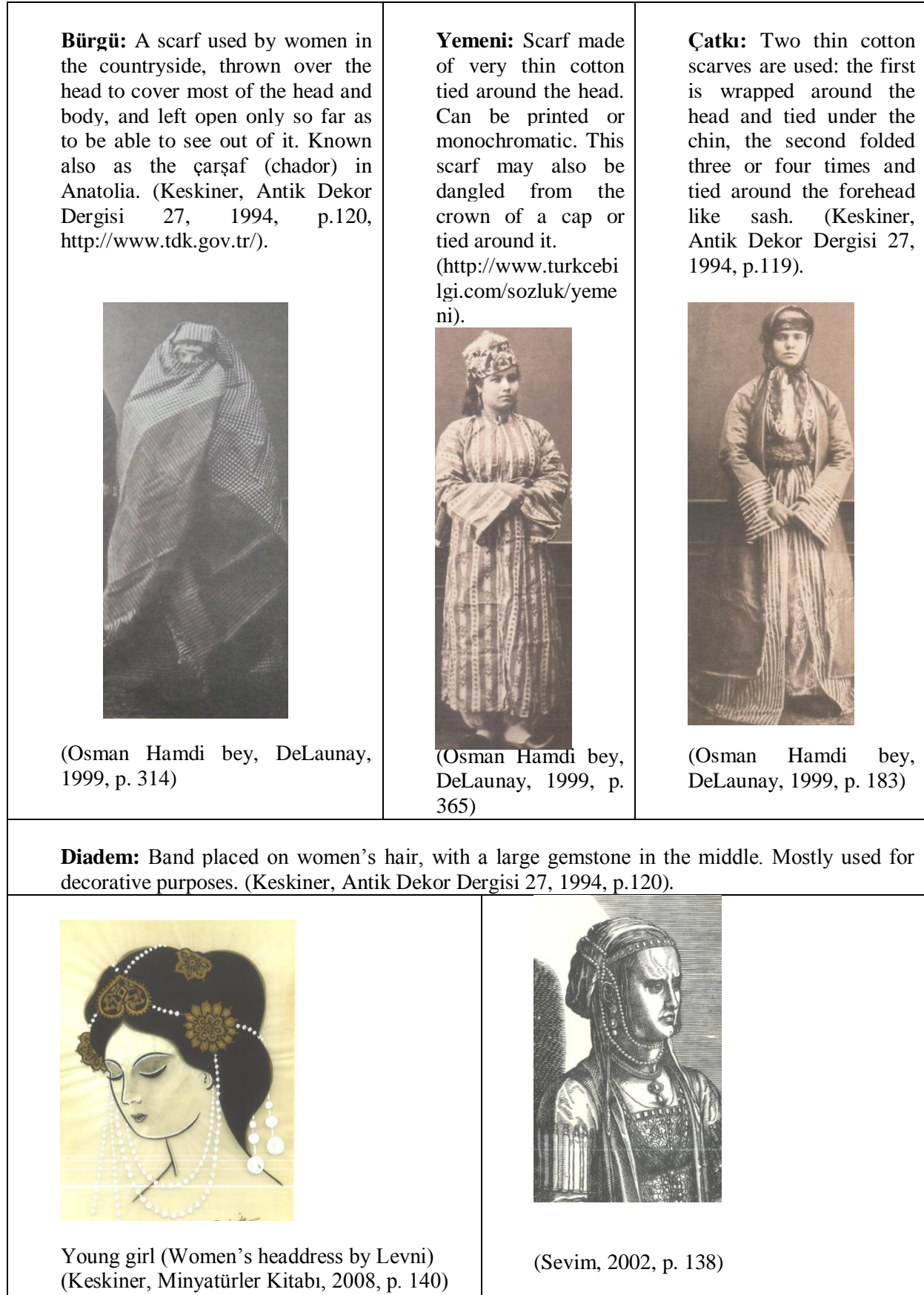
Table 1: Examples of women's headdresses used in Anatolia