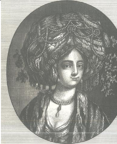
Woman Wearing Tarpuş (Sevim, 2002, p.150)

Tarpuş: Flat cap, could be decorated with gemstones or pearls to give an impression of grandeur or power.