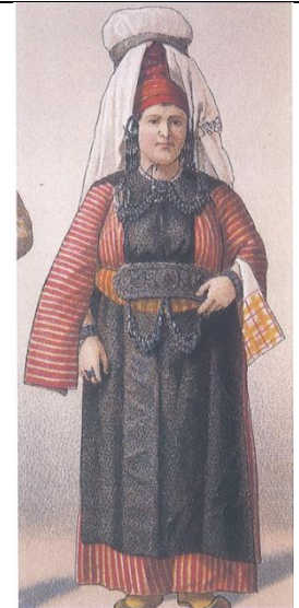
Woman Wearing Yozgat Afşar Style Serpuş (Türkoğlu, Antik Dekor Dergisi 27, 1994, p.61).

Serpuş: A type of hat, providing different styles by means of thin cotton scarves tied around the conical hat.