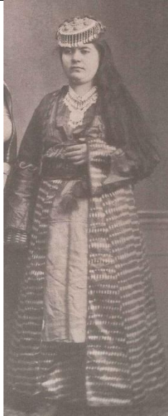
(Osman Hamdi bey, DeLaunay, 1999, p. 299)

Tepelik: Metal decoration covering the crown of the fez and becoming the main component of headgear, obliterating the already insignificant fez (Hamdi bey, DeLaunay, 1999, p. 302). Metal sequins, medals and chains might be used on the tepelik, and the style and value would vary according to the wearer's income and status.