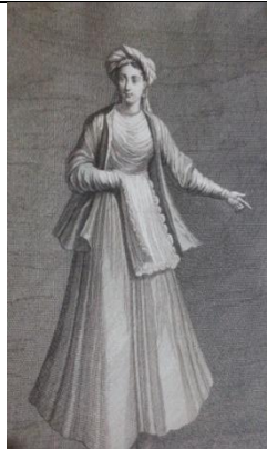
Young girls of Patmos tie white cotton scarves around their head like a sarık (Mour, 2013, p. 75) Patmos, a small island in the Aegean, is also called Patnoz or Patnos ( http://tr.wikipedia.org/wiki/Patmos ). It is thought to be unrelated to Patnos, the county of Ağrı, since the clothing in the picture is similar to clothing worn on the Aegean islands.