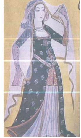
Topkapı Palace Museum, Istanbul. (Keskiner, Antik Dekor Dergisi 27, 1994, p.120.)

Veil: A one-piece cloth completely covering the face (Keskiner, Antik Dekor Dergisi 27, 1994, p.119). Used outdoors, it is intended to obscure the face and provide anonymity.