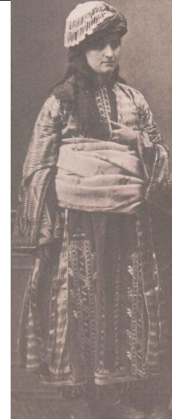
Osman Hamdi bey, DeLaunay, 1999, p. 346)

Sarık: The name for pieces of fabric wrapped on or around caps. A great variety of examples exist (Yeni 2009:245). Besides thin cotton or cheesecloth, hand-woven fabrics or valuable silks might also be used.