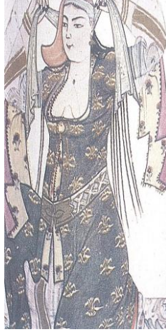
(Woman Tying Her Kaşbastı) Topkapı Palace Museum, Istanbul Süheyl Ünver, Levni, Milli Eğitim Basımevi, Istanbul 1951 http://www.altarmodeling.com/levni_kadin_figuru.html