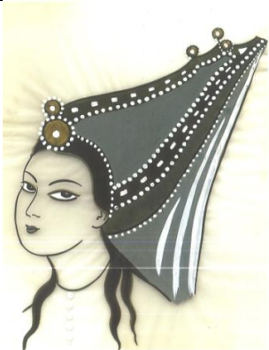
Ottoman Court Lady's Headdress (Women's headdress by Levni) (Keskiner, Minyatürler Kitabı, 2008, p. 138)

Istefan: Described in the Codex Vindobonensis written in 1590 in Vienna as crown-like ornaments worn on caps by women of high social standing. The crown worn on the head is known as Istefan in Turkish, and often decorated with gemstones (İrepoğlu, Antik Dekor Dergisi 50, Jan. 1999, p.126-129, Çağman, 1993, p. 286, Akurgal, 1990, p.443).