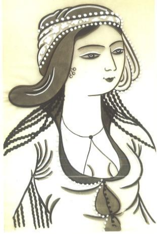
Women's headdress by Levni (Keskiner, Minyatürler Kitabı, 2008, p. 147)

Kaşbastı: A broad band of cloth tied around a scarf covering the hair or head. Probably intended to prevent the scarf slipping off, it also provides a look of elegance (Keskiner, Antik Dekor Dergisi 27, 1994, s.117).