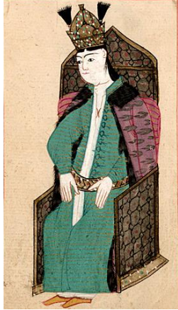
In his album describing Ottoman society, Rålamb drew the headgear of the woman he identified as queen as a crown, symbolizing power and grandeur. The Rålamb Costume Book: A Digital Presentation of a Manuscript in the Royal Library. ( http://greatestbattles.iblogger.org/Ottoman/Album/Ralamb.htm#1 )

Crown: Decorative headgear worn as a symbol of nobility, power or reign, usually decorated with jewels ( http://www.dilforum.com/forum/archive/index.php/t-81784.html ). The workmanship of the precious metal and the gemstones convey the status and power of the wearer.