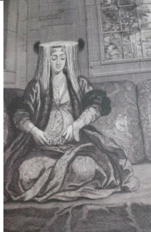
The girl in the painting is wearing a flat silver cap with a golden ornament falling onto her shoulders (Mour, 2013, p. 71) This is thought to be a kind of tepelik.