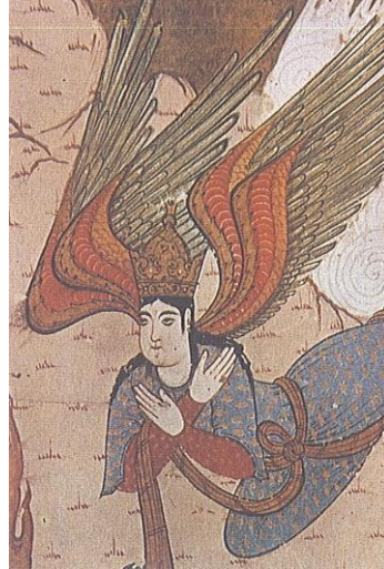
Angel wearing crown by Siyer-i Nebi (Keskiner, Antik Dekor Dergisi 27, 1994, p.122).