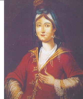
C.Usta, Ottoman Woman, 17 th Century, Ptuj Museum. (İrepoğlu, Antik Dekor Dergisi 50, Jan. 1999, p.126-129).