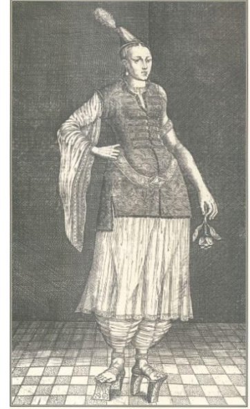
Turkish Woman (Sevim, 2002, p. 158)

Hotoz: A cap covering the hair except for bangs and locks in front of the ears, high in the front, with an open or closed crown, decorated with gems, embroidery or feathers ( http://www.msxlabs.org/forum/x-sozluk/281872-hotoz-nedir.html#ixzz310X8Dalu ). Generally worn indoors (Keskiner, Antik Dekor Dergisi 27, 1994, p.122).