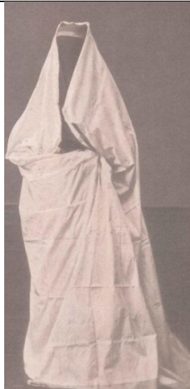
Osman Hamdi bey, DeLaunay, 1999, s. 305)

Serpuş: A type of hat, providing different styles by means of thin cotton scarves tied around the conical hat.