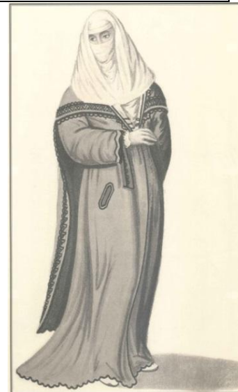
Turkish Woman Wearing Yashmak. (Sevim, 2002, s. 17)