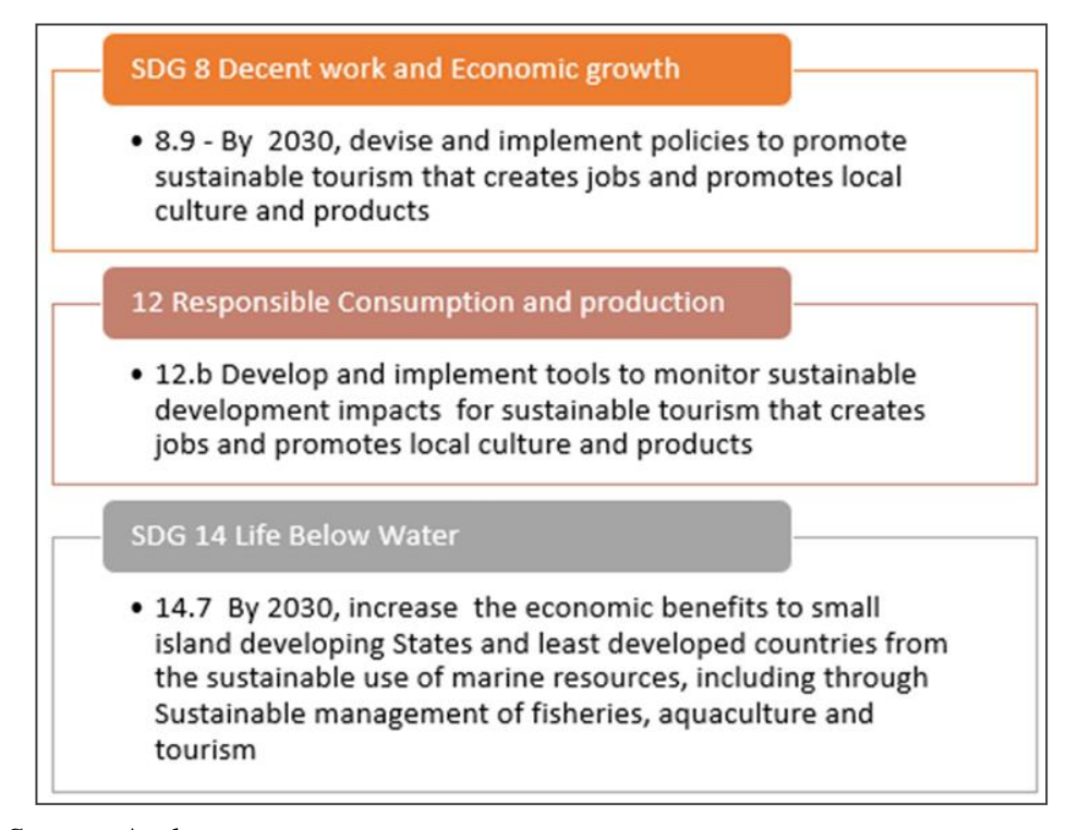
Figure 1: Tourism and Agenda 2030 positioning

The year 2017 was proclaimed a year of Sustainable Development by the World Tourism Organization to rally the tourism industry and role players to consider tourism as a tool to achieve Sustainable Development Goals (SDGs). Nearly four years after the adoption of SDGs in 2015 and two years post the year of Sustainable Tourism there has been very little work done to demonstrate how the tourism sector is and can embrace the SDGs to ensure a more sustainable tourism future. The United Nations had initially identified three areas where tourism could play a leading role, as shown in Figure 1.