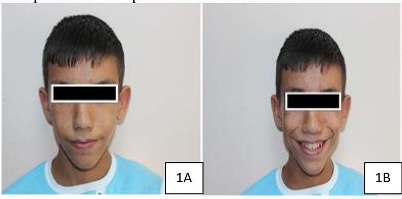
Figure 1A: Normal appearance Figure 1B: Crying facial expression when laughing

crying facial expression when laughing (Figure 1B). His neurological examination was normal. His laboratory results at admission were as follows: hemoglobin:8.7 g/dl, serum creatinine: 2.4 mg/dl and urea:82 mg/dl. On renal ultrasonography; bilateral hydroureteronephrosis, thinning of renal cortex and thickening of bladder wall were present. Bilateral grade 5 vesicoureteral reflux (VUR) (Figure 2A) and increased bladder capacity (Figure 2B) were detected in voiding cystourethrography. In urodynamic examination, flask neuropathic bladder was determined. His lumbosacral magnetic resonance imaging was normal. In dynamic renal scintigraphy, functions of left kidney were decreased and the right kidney was nonfunctioning. During follow-ups, he had episodes of pyelonephritis. At 12 years of age, he underwent right nephrectomy and left ureteroneocystostomy. Episodes of pyelonepritis continued to occur despite of clean intermitten catheterization and prophylactic antibiotherapy. He was put on hemodialysis due to chronic renal failure at 15 years of age. At 16 years of age, renal transplantation was performed.