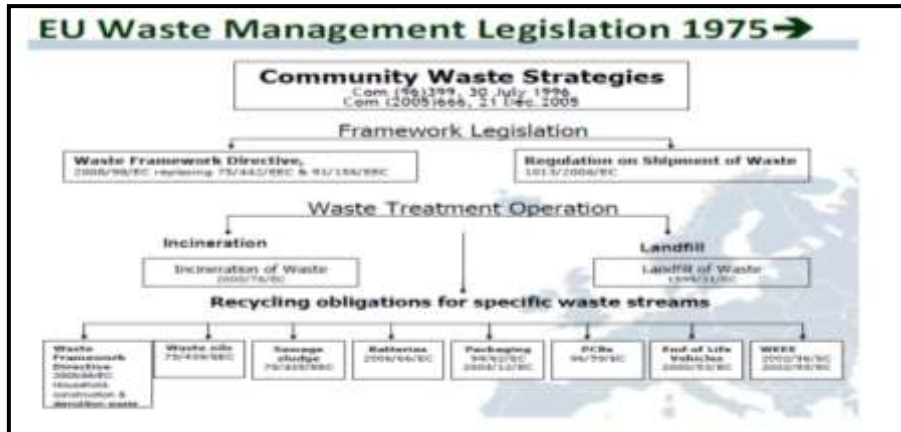
Figure 1. EU waste management legislation outlook 8