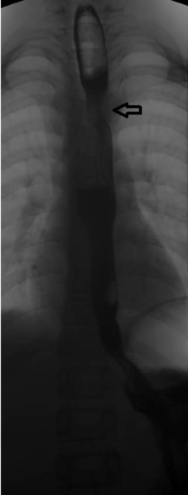
Figure 2: Esophageal x-ray with barium shows vascular compression (arrow) in the proximal part of the esophagus due to aortic arch.