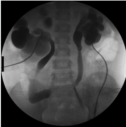
Figure 1. MR pyelography: Bilateral increase in renal size and hydroureteronephrosis