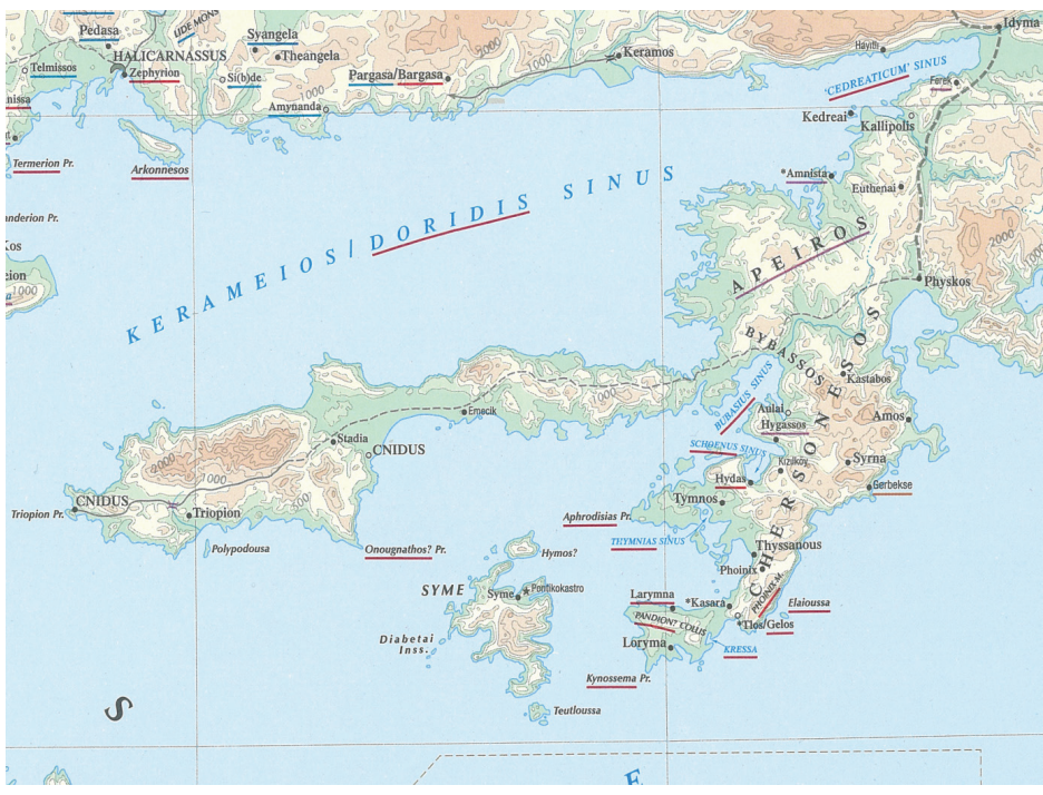
Fig. 1. Cnidus and its Vicinity

opium which was called after him<sup>6</sup>. This place was his base from where he made campaigns to win for himself "both the Cherronesus and a large part of neighbouring Caria". It is possible to infer from these texts of Diodorus that the first settlers seem to have come from Thessaly in Greek mainland to Syme and that 'the Cnidians' were member of this colony (Diod. V. 53. 3). Thessalians may have come before the Lacedaemonians and the Argives who later on after the Trojan War colonized Syme (Diod. V. 53. 2)<sup>7</sup>. But the first settlement appears to have been established in the promontory of Triopium and then later on extended to the mainland just across this place. This first landing place, Triopium, became sacred for the Cnidians, being related to the cult of Apollon as overseer of the colonizers<sup>8</sup>.