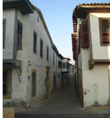
Figure 4- Dervish Pasha Street

According to research there are no structures in the historical texture of Dervish Pasha Street dating before the Ottoman Period of Cyprus. The texture formation of the street began with the Ottoman Period (Figure 5).