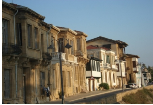
Figure 2- Historical Texture of Arabahmet District (Author-2018)

The restoration works that started with the financial support of UNHCR in the district, which is special protected area under the Nicosia Master Plan (1981) failed to reach its goal due to financial insufficiency.