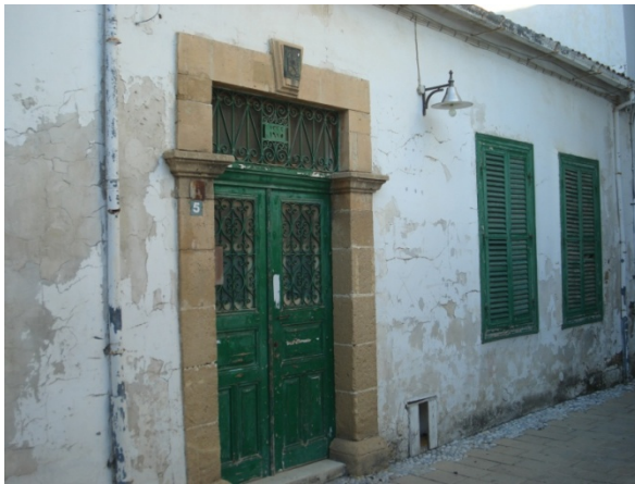
Figure 17- Dervish Pasha Street No: 5

The house in the east of the south side of the street, numbered 12, was added to the street texture in 1924, as is shown on the iron grid above the lintel level of its door. This two-floor house has an asymmetrical façade. Its double wooden door, and the window on the ground floor are framed with overflowing superficial stone posts. The windows are oblong shaped, with two wooden sashes. On the west side of the upper floor there is a narrow balcony carried on two iron consoles on each side and a wooden one in the middle, stretching east-west, with the base made of wooden planks placed on a rectangular wooden beam. The balcony is surrounded by iron railings. A wooden, double sash door opens to the balcony (Figure 5, 18).