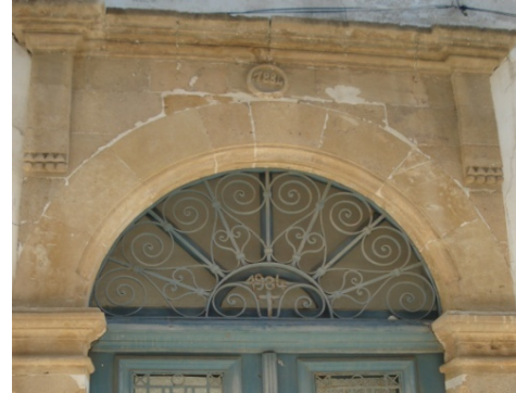
Figure 9- Arch of door (Cons. Date) of No:17 (Author-2018)

The second building in the street, belonging to the British Period, is the two-floor house at No. 14, placed in the south-west side of the street. The date 1893, on the door of the house is assumed to be the year of construction of the building. The semi-circle arched door and the ground floor window of the asymmetric front building have stone door posts. The windows of the building have wooden blinds, and a balcony with iron railings, and a wooden base carried by iron cantilevers at the upper level of its door (Figure 5, 10, 11).