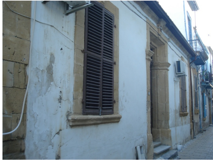
Figure 14- Dervish Pasha Street No: 10 (Author-2018)

The single floor building at number 7 takes place on the west part of the north of the street and is a British Period building. The construction date is 1913 (H. 1331), placed on its door. From the information obtained from the Nicosia Turkish Municipality, which carried out the renovation in 1998, reveals that the authentic ground level was 30 cms lower than the present one and that it was built on top of the remains of Lusignan Period (1191-1489), when it was laid with tacked pebble stones. The building with a middle hall plan, has a yard and a symmetrical façade. Its door on the front axle has stone posts, and the windows have two sashed, wooden blinds. Built as a house, the building is used as an art atelier at present (Figure 5, 15, 16).