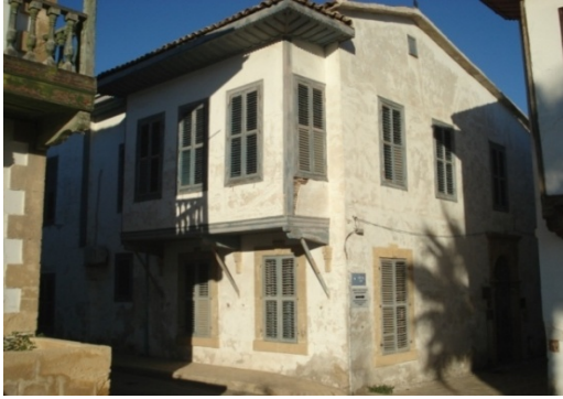
Figure 8- Dervish Pasha Street. No: 17