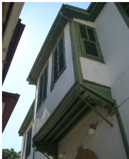
Figure 13- Corbel of Dervish Pasha St. No: 4 (Author-2018)

The house at number 10, on the west of the south side of the street is another building added to the texture of the street during this period. Estimated to be built in 1914, from the date on its door, this building is a ground floor house with a symmetrical façade. On the front façade there is a door in the middle, and a window on each side of it. The door and the windows with wooden blinds with two sashes have stone posts, and border stones on the level of the eave (Figure 5, 14).