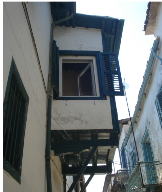
Figure 22- Corbel of Dervish Pasha St. No:15