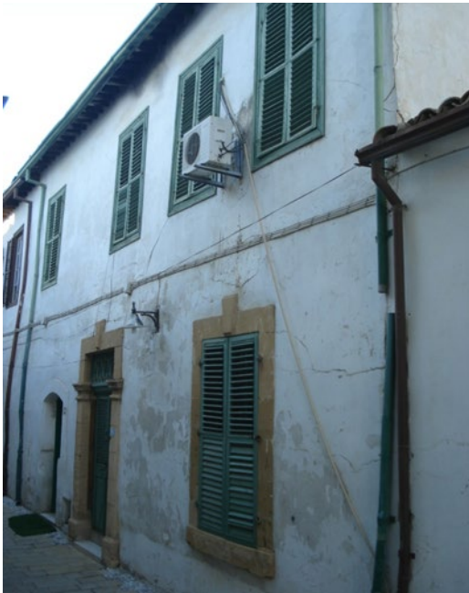
Figure 19- Dervish Pasha Street No: 9, 11 (Author-2018)

Many buildings in the street texture built during this period, reveals the fact that the British period was the development period of the creation and formation of the historical texture of Dervish Pasha Street.