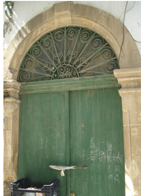
Figure 11- Door of Dervish Pasha St. No: 14