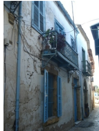
Figure 18- Dervish Pasha Street No: 12

Contributing to the formation of the historical texture of Dervish Pasha Street are five more houses, although no information was found on their construction dates. These buildings shown in the 1881, 1915, and 1934 city plans of the walled city of Nicosia correspond with the British Period.