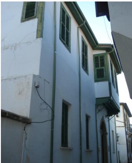
Figure 12- Dervish Pasha St. No:4