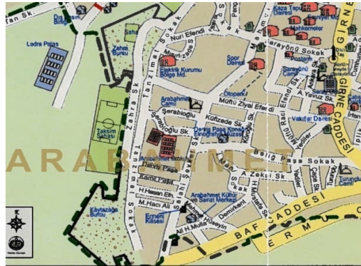
Figure 1- Arabahmet District Plan (Map Office of TRNC-2014)

Being close to the governor's mansion in the Sarayönü Square, the area became the district of residence of high-ranking state officials, pashas (Beliğ Pasha, Dervish Pasha, Kamil Pasha), and the Turkish Muslim elite during the Ottoman Period. Evening breezes prevailing in this district during the hot Nicosia summers, also contributed to people preferring this district (Figure 1).