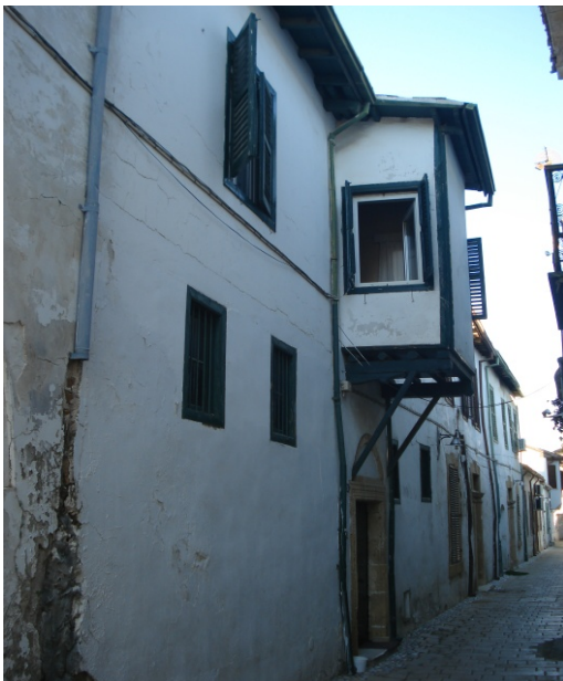
Figure 21- Dervish Pasha Street No: 15 (Author-2018)