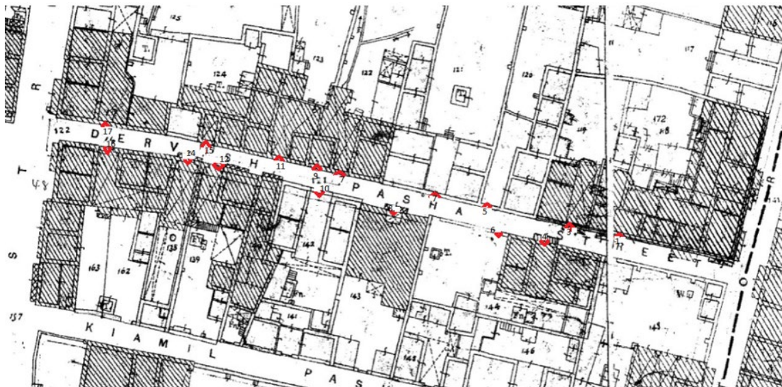
Figure 5- Historical Texture of Dervish Pasha Street (Buildings' Plans) (Town Planning Office of T.R.N.C. - 2018)

According to research there are no structures in the historical texture of Dervish Pasha Street dating before the Ottoman Period of Cyprus. The texture formation of the street began with the Ottoman Period (Figure 5).