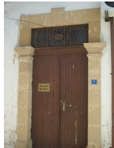
Figure 16- Door of No: 7 (Author-2018)

Another building of this period is at number 5. The construction date of this building, placed on the east side of the north face of the street is assumed to be 1915 (H. 1333), as the date is placed on its door. On the west side of the plastered asymmetrical front of the house is a wooden double door with cut stone posts, and on the east side two windows with double sashed wooden blinds (Figure 5, 17).