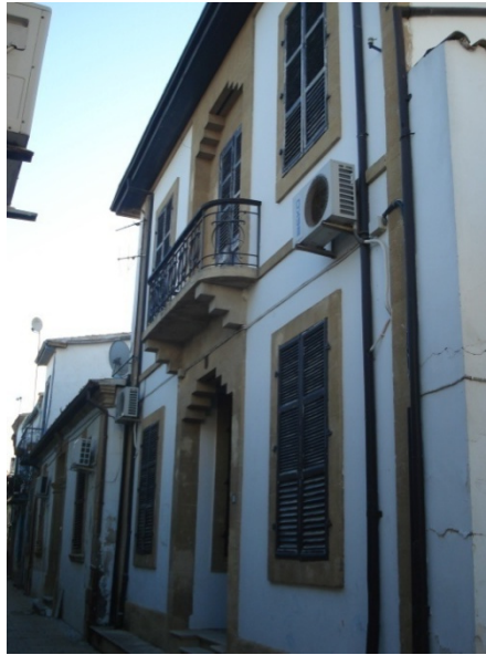
Figure 23- Dervish Pasha Street No: 8 (Author-2018)