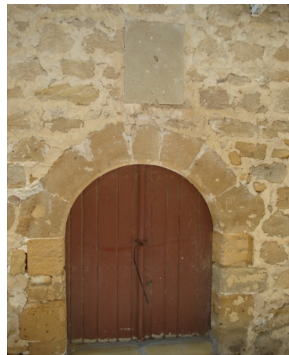
Figure 7- Arched door and Clock figure of No: 16