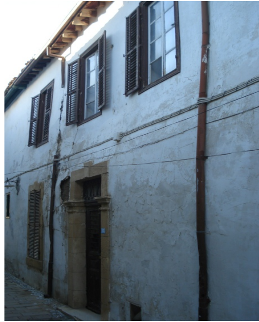
Figure 20- Dervish Pasha Street No: 13 (Author-2018)