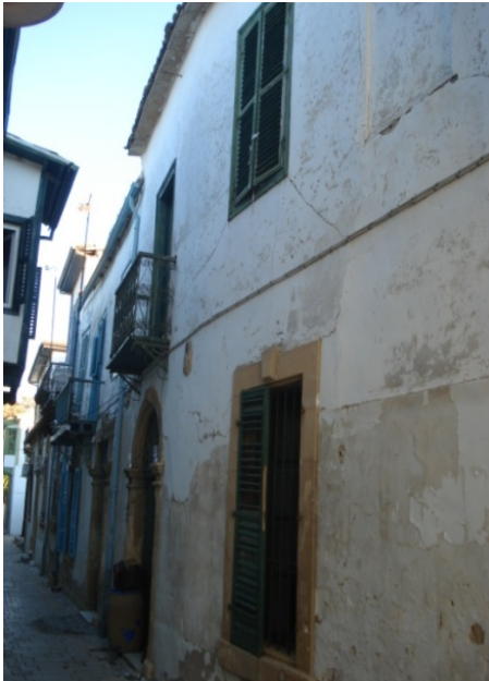
Figure 10- Dervish Pasha Street No:14