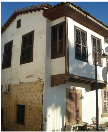
Figure 6- Dervish Pasha Street. No: 16

Based on the dates 1791 and 1801-1802, and the Nicosia city plan of 1881 (Kitchener Map), the first structure of the historical texture is the house placed on the corner parcel on the south side of the west end of the street, addressed as number 16. This two-floor house with wooden blinds is of the Traditional Turkish House character, over brimming to Tanzimat Street in the west, with a wide eave projection, supported with C-S curved wooden cantilevers. It is assumed that the clock face figure showing 12:30 on the north face of the house is related to the former name of the street "Saatçi Street" (Figure 5, 6, 7).