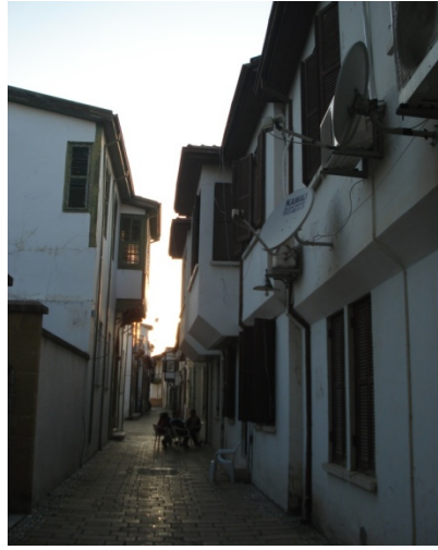
Figure 24- Dervish Pasha Street No: 1, 3

Renovation work started in the street in 1989 by the Nicosia Turkish Municipality, financed by the UNHCR, and the work comprising front face of buildings and street base cover, continued until 1997.