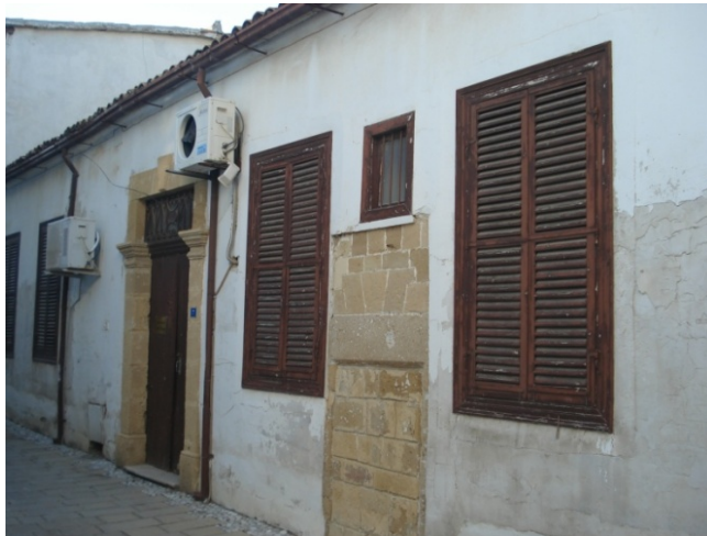
Figure 15- Dervish Pasha Street No: 7