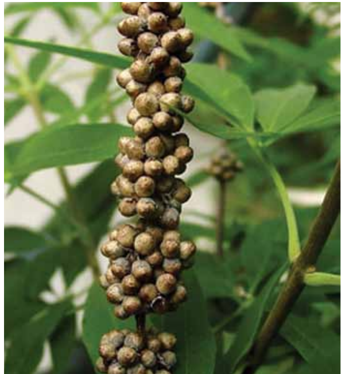
Figure 1.: Vitex agnus castus (httpI).

Studies have shown that extracts of Agnus castus can stimulate the release of Lutenizing Hormone (LH) and inhibit the release of Follicle Stimulating Hormone (FSH). This suggests that the volatile oil has a progesterone-like effect. Its benefits stem from its actions upon the pituitary gland specifically on the production of luteinizing hormone. This increases progesterone production and helps regulate a woman's cycle.