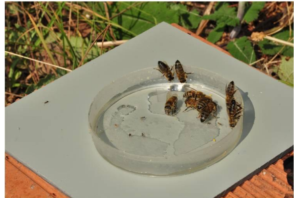
Figure 2: Example of a feeding station.

bees search for the nectar source between feedings. Once the artificial feeder has several bees regularly visiting, move it several meters at a time until you reach the location where you plan to perform the experiment. Figure 2 provides an example of an artificial feeder.