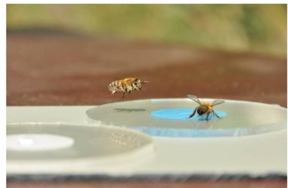
Figure 6: The same bee landing on the blue target in another visit. Notice the presence of the intruder bee hovering nearby.

The data during the extinction phase can be plotted cumulatively for both the previously correct target and the previously incorrect target during each 30 second period. For example, if the bee lands on the correct target 6 times and the incorrect target 2 times these values will be plotted for the first 30 second period. If during the next 30 second interval the bee lands on the correct target 7 times and the incorrect target 2 times the values plotted for the second 30 second period will be 13 (6+7) and 4 (2+2), respectively.