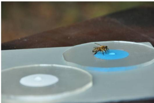
Figure 5: A bee landing on the blue target in a blue/white discrimination task. Blue is the S+ target.

The results of the acquisition phase can be analyzed in a number of ways. One way is to plot the number of correct responses across the 24 training trials. You will notice as the number of trials increase so do the correct number of responses. The number of repetitive errors will also decrease as the bee gains experience with the training situation. Return times can also be plotted and you will find that after the first few visits they will become a bit shorter. Figures 5 and 6 show the results of a bee landing on the correct target in a situation where blue is the S+ and white is the S-. Notice the intruder bee in Figure 6.