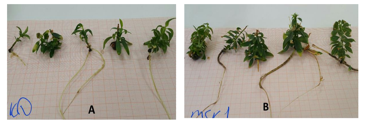
Figure 3. A. Rooted small plants (MSK-0); B. Rooted small plants (MSK-1).

effects of multiple hormone combinations remained limited in the root development of SP-2 ( P. spinosa ) rootstock candidate. Besides, only indole-butyric acid (IBA) application would be sufficient.