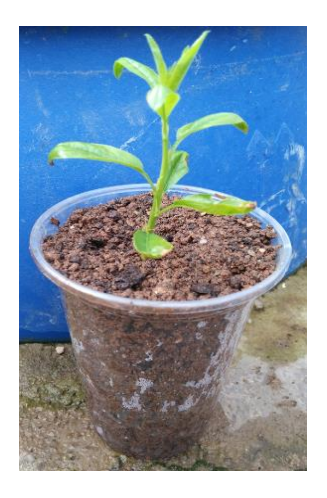
Figure 4. Acclimatization of rooted plants in viol and pot.