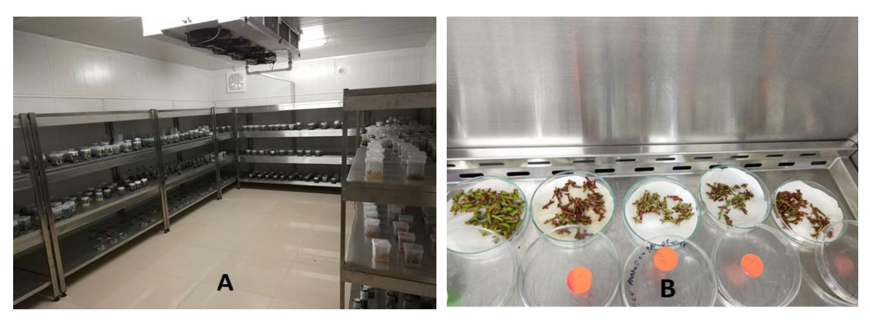
Figure 1. A. Climate chamber, B. Sterilization procedures.

The study was established in a trial experiment layout of randomly selected parcels and as five explants on each petri and three petri dishes at each repetition. Analysis of variance (ANOVA) was applied to the obtained data, and the LSD test was used for multiple comparisons (Armitage, Herbert, 1996).