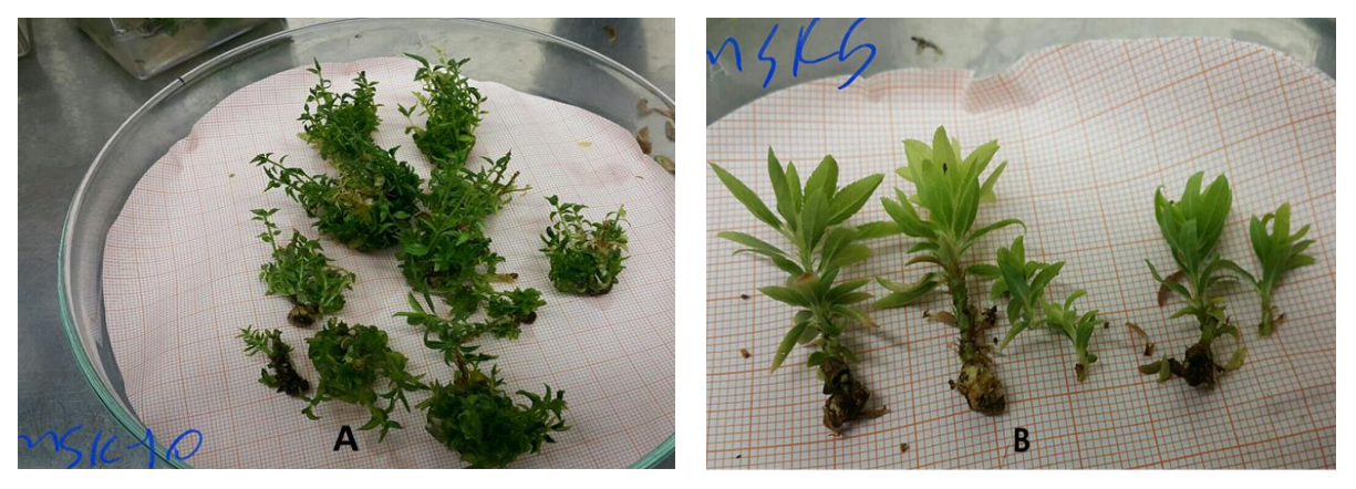
Figure 2. A. Companion plants on explants; B. Separated companion plants.

F^{**} P \le 0.01 and F^* P \le 0.05 shows significance level. Distinct letters in the first and second columns indicate significant differences according to LSD's test ( P \le 0.05 ).