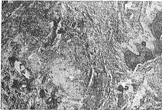
Fig. 7. — Photomicrograph showing islands of cementum/cementicles, bone and odontogenic epithelium in a mature connective tissue (Sharpey's fibers), Hematoxylin and eosin stain, x 100.

Microscopically, the specimen consisted of cellular fibrous connective tissue containing islands of cementum, bone and odontogenic epithelium. There were connections between the bone and