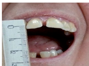
Figure 3. Patient's maximum mouth opening.