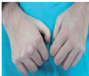
Figure 1. Patient's fingers were fixed at claw-like position.

Decreased number of wrinkles were also observed. Upper lip was insufficient to cover maxillary teeth, which is also known as “mouse-like face”. Anamnesis revealed that the patient had Raynaud phenomenon. She had used cortizone and acetylsalicylic acid for twenty years due to the vascular decomposition. Although Raynaud’s phenomenon and acrosclerosis were present in our case, there was no internal organ involvement. Patient complained about the dryness of her mouth and multiple caries lesions were observed. Trismus and increased overjet were observed in the intra-oral examination.(Figure 3). Panoramic radiography disclosed bone resorption in the right mandibular angle region of the mandible and in both ramus (Figure 4). The patient was referred to the departments for specialized dental treatment.