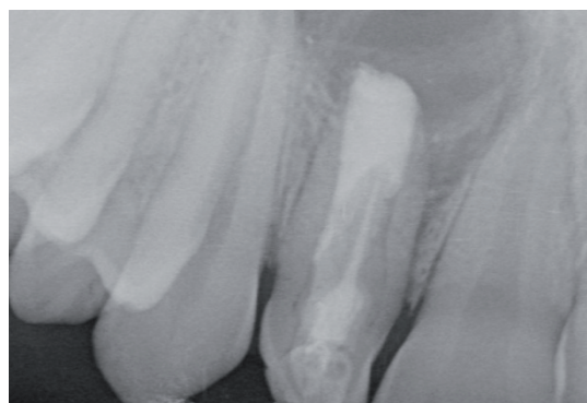
Figure 4. Postoperative radiographic appearance after root canal filling.