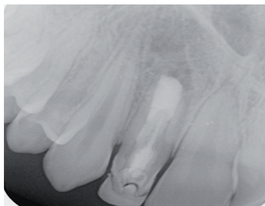
Figure 5. 12-month follow-up radiograph.

Endodontic treatment of teeth with invagination might be difficult because of residual infected debris and microorganisms that cannot be eliminated by conventional methods.