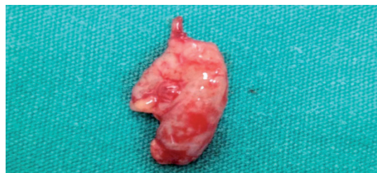
Figure 3. Appearance of removed granulomatous lesion.

Teeth with dens invaginatus are more susceptible to caries due to deep pits and surface irregularities that enable microorganism adhesion and colonization (6).