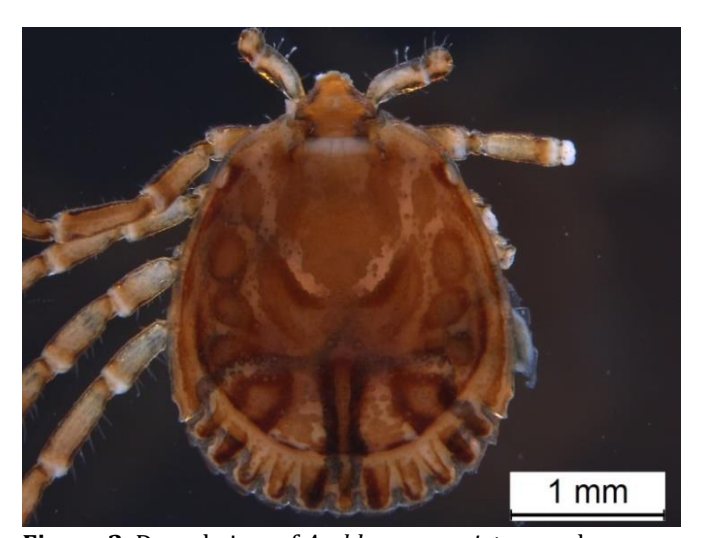
Figure 2. Dorsal view of Amblyomma mixtum male.

Other works in America report a diversity of ticks that parasitize jaguars, according to the region. In a study covering several states and biomes of Brazil nine species of tick were collected in 26 jaguars, highlighting Amblyomma cajennense s.l., R. microplus and the equine tick Dermacentor nitens Neumann (Labruna et al., 2005). In Mexico, adults of Ixodes scapularis Say and A. mixtum (cited as A. cajennense) were collected from a female jaguar captured in Tamaulipas (Almazán et al., 2013). In Belize, Lopes et al. (2016) reported larvae of Amblyomma coelebs Neumann, and adults of A. ovale, Amblyomma cf. oblongoguttatum Koch, and I. affinis in two jaguars. These data stand out the importance of jaguars as hosts of different tick species, both in ticks that parasitize carnivores, and in those that are opportunistic. Moreover, the presence of ticks as A. mixtum, A. cajennense, R. microplus or D. nitens, indicates the presence of jaguars hunting in grazing areas, which is potentially indicative of habitat loss and possibly also of prey.