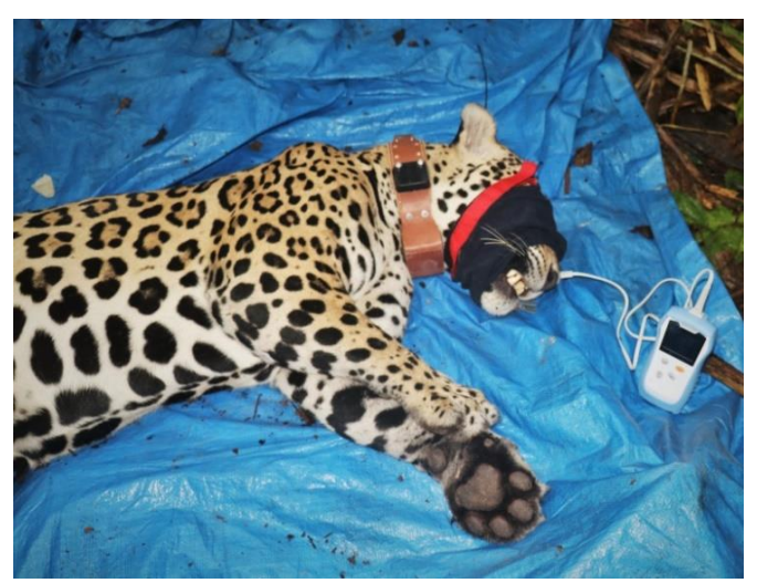
Figure 1. Female jaguar captured and fitted with a GPS collar to monitor her movement. Under sedation the vital signals were monitored while a black towel was used to cover her eyes.

distribution, e.g. A. ovale and I. affinis inhabit forested and rural regions below 700 meters above sea level, and I. boliviensis subsists at elevations above 1700 m a.s.l. (Fairchild et al., 1966; Bermúdez et al., 2018).