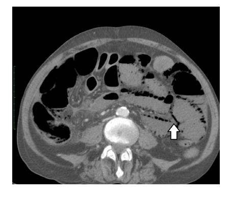
Figure 1a: Computed tomography demonstrating pneumatosis intestinalis within the walls of the bowel

A 59-year-old male admitted to emergency service with complaints of nausea, severe vomiting, abdominal pain and swelling that had begun 3 days prior. The patient was hemodynamically stable and had mild generalized abdominal pain but with a soft distended abdomen. His past medical history was chronic renal failure. On admission, his temperature was 37.6°C, his heart rate was 52 beats/min, his respiratory rate was 13 breaths/ min and his blood pressure was 100/60 mmHg. The laboratory test results on admission were within the normal limits except white cell count was slightly elevated at : 11200/ml, with C-reactive protein raised to 48 mg/l (normal: 0-3mg/l), hemoglobin level (Hb: 10.6/ dL) and normal platelet count. The blood biochemical test results were as follows: blood urea nitrogen (BUN): 137 mg/dl, creatinine: 6.52 mg/dl, the others were within normal limits. Chest X-ray was normal. PVG was revealed in ultrasonography (USG). On the computed tomography (CT) imaging of the whole abdomen intramural gas within the bowel was seen logical with PCI (Figure 1a) and with evidence of air in the intrahepatic portal system (Figure 1b).