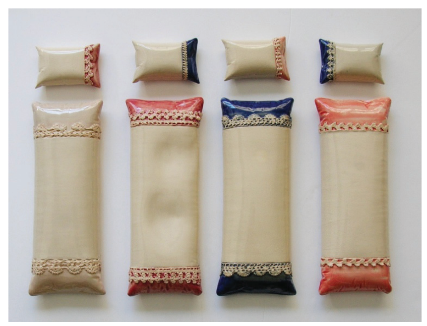
F.19. Ezgi Hakan Verdu Martinez, "Dowry of Hatice Sultan", Stoneware, Casting, Arrangement, 4 x 35 x 50 cm 1200 C, 2007 (https://ezgihakanvmartinez.files.wordpress.com/2013/07/1.jpg)