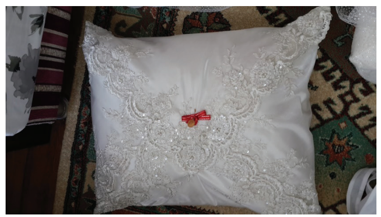
F. 2. Traditional Turkish a Dowry Bundle (https://dunyaevirenkleri.blogspot.com.tr/2015/10/soznisan-bohcas-susleme.html)

Artist Safiye Başar made her own dowry bundles with reference to traditional bundles. A dowry bundle is a piece of cloth that newly married girls put into the products they will use after marriage ( F. 2 ).