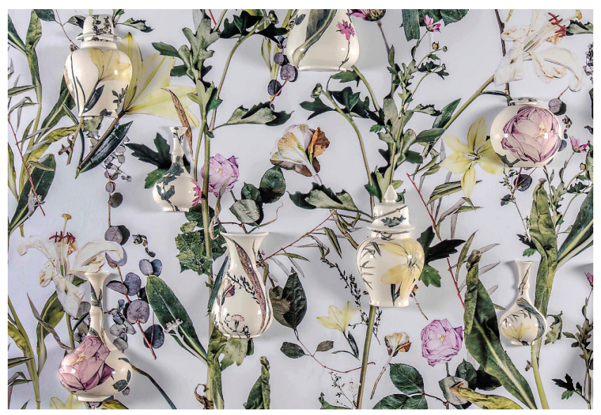
F. 21. Burçak Bingöl, "Temporary Permeable", Detail, (Artist's own collection)