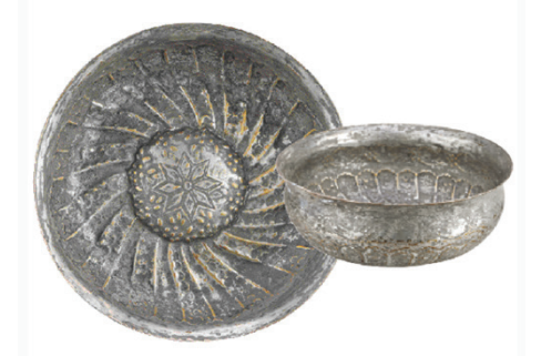
F. 5. Traditional Turkish Bath Bowl

The works of artist Mehmet Tüzüm Kızılcan are works emulating the past. Among his works, epitaphs on tombstones, door locks and glazed peshkirs are quite interesting. In his exhibition "The Bath Bowl", the artist discusses Turkish bath culture. The bath bowl is a round-shaped water pouring tool in swage technic made of raw materials such as silver, copper, and brass<sup>14</sup> (F.5).