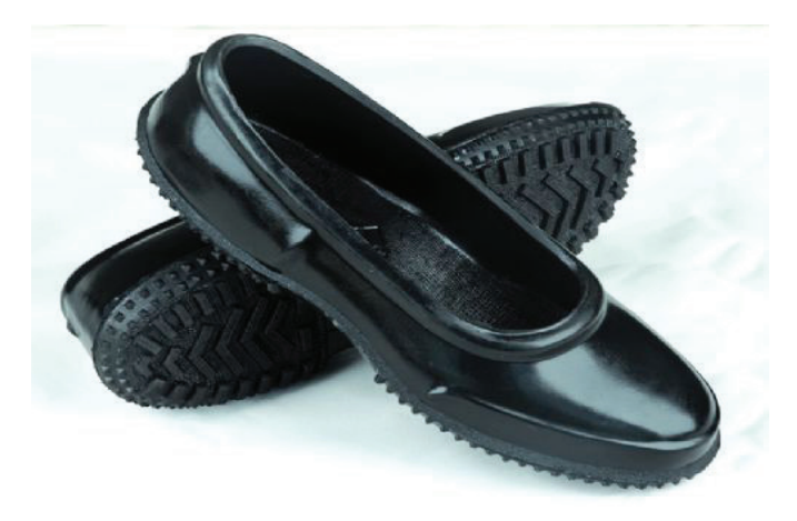
F. 9. Tratidional Turkish Rubber Shoes (https://tahiromer.wordpress.com/2016/03/04/kose-yazisikara-lastik/)

Çobanlı, while expressing the value of women in social life at every opportunity, argues for the need to be strong in the face of the difficulties women face in social life. In her work titled "Let's not forget our past from the Black Days to the light", she describes bare-foot, nylon sandals and the post-changing situational transition.<sup>19</sup> These forms are shoes made of simple material, especially worn by poor Anatolian people due to their poverty and material need (F. 10).