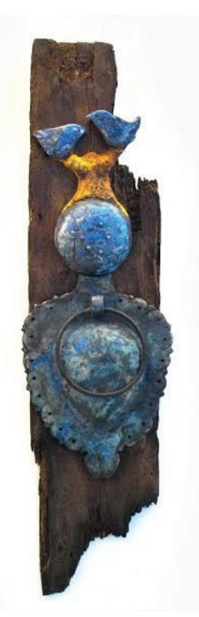
F. 14. Aydan Birdevrim, "Love in Safranbolu", Hand-shaped, 85 \times 25 cm.1000 °C (Artist's own collection)

Betül Demir Karakaya's artwork involves the depiction of bells, which are cultural objects that we can see in almost any culture and she created bells in a different way and added acoustic characteristics to some of them. In most cultures it is seen that bells are stylistically similar to each other, and that they have different functions. For example, there are functional bells such as those in bell towers used with clocks, bells that inform the end of the lesson in schools, bells that inform the time and the time of worship, sheep bells, and bells that announce dinner time. Karakaya states that bells come across as a very familiar icon in their deep origin, aesthetic and cultural sense, and that the origin dates back to prehistoric times, and that they are a symbolized object found in all ages and civilizations. With the deep meaning that Karakaya loads on the bells, she has also transformed them into an aural expression by activating the sound in a perceptual sense to different forms of the bells she created.<sup>26</sup> Karakaya's bells have both acoustic and aesthetic value in the foreground and leave poignant and splendid effects on the audience. The visual in F. 15 is an artwork by the artist