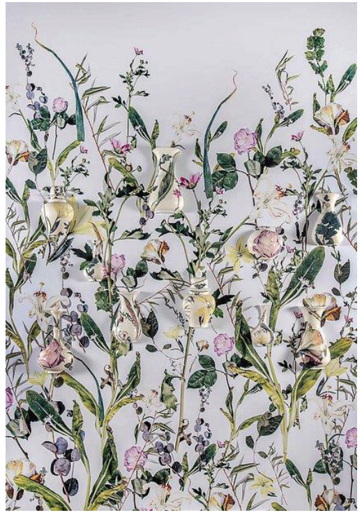
F. 20. Burçak Bingöl, "Temporary Permeable", 2016, Site-specific Installation, Ceramics, Wallpaper, 290x180 cm. (Artist's own collection)