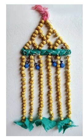
F. 11. Traditional Turkish Harmal Seeds (http://iyilesmeakademisi.blogspot.com.tr/2017/07/uzerlik-ya-da-nazar-otu.html)