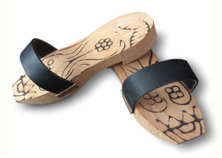
F. 7. Clog (https://www.lafsozluk.com/2017/11/takunya-nedir-ne-demektir-anlami.html)

Another artist who produced ceramic works related to Hamam culture is Hadiye Güvenateş Kılıç. Kılıç was influenced by products such as bath bowls, soap dishes, mirrors and clogs used in baths and covered in ceramic artworks. Clogs are a type of slippers made of wood, usually worn in wet-soled places such as baths, lower than a high-soled but similar slipper<sup>16</sup> (F. 7).