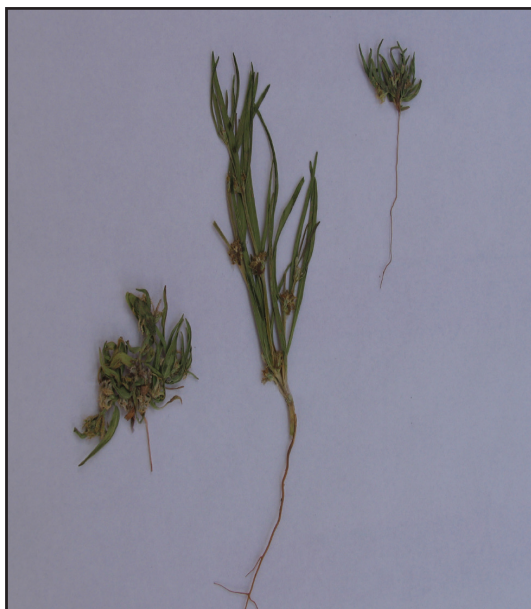
Figure 8. Dipterocome pusilla