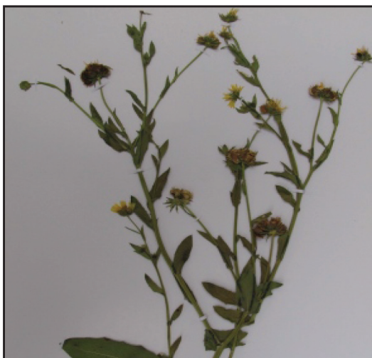
Figure 3. Calendula karakalensis

Some studied specimens: Golestan: Moraveh Tappeh, 300 m, Hwer 3625 (TARI); 22 km to moraveh Tappeh, on the road from Inche Boroon (CG3), 180 m, Assadi and Maasoumi 55433 (TARI); Gonbade- Kavus, Sharif 7700- IRAN.- Mazandaran: Rout Amol, Esfandiari 7706 – IRAN; Chalous towards Marzanabad, 17 km Chalous, 300-400 m, Termeh and Matine 7686- IRAN.- Gilan: Roud Lar, Barkhordari 7672-IRAN.- Azarbaygan: Arasbaran protected area, Ghaghalu, 660 m, Assadi and Vosughi 24551 (TARI); Arasbaran