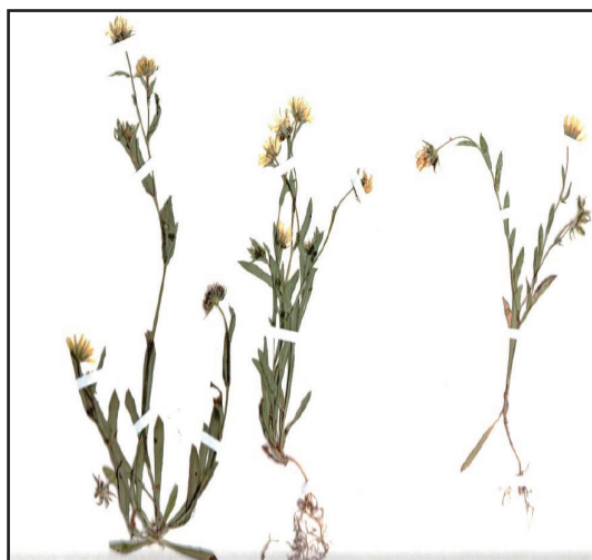
Figure 5. Calendula persica

Some studied specimens: Golestan: Center Gorgan to Pahlavi dej, Ghorban abad, Ridel and Ershad 7655-IRAN.-Kermanshah: Ghasre- shirin, Vakilian 7663-IRAN.- Lorestan Khorramabad, 1400 m, Rayhani 25707-IRAN; Pol-e Dokhtar, 110 km from Khorram abad on road to Andimeshk, 1000 m, Wendelbo and Assadi 16606 (TARI).- Kohkiluyeh va Boirahmad: 5 km from Shamsabad to Basht (VP3), 700 m, Assadi and Aboohamzeh 38619 (TARI).- Fars: Farashband, kuh-e Pir, near Konar malek, 800-1300 m, Iranshahr and Termeh 7669- IRAN; Lar, Mojib 7661-IRAN; Shiraz, Bamu park, 1900m, Dehbozorgi 32730-IRAN; 6 km NW of Kazerun, 870m, Runemark and Mozaffarian 26730 (TARI).- Hormozgan: Center Bandar-e Khamir et Bandar-e Lengeh, near Dezhgan, Iranshahr and Termeh 7658-IRAN; Khuzestan, Sabzevari 7664-IRAN.- Bushehr: Center Kangan et Khormuj, 12 km N Abdan, Iranshahr and Termeh 7659-IRAN;