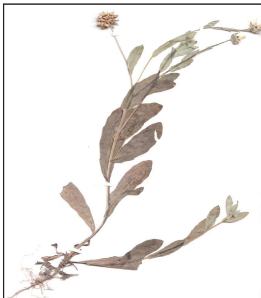
Figure 7. Calendula alata

Distribution in Iran: N, NW, W, C, NE, S, SE.