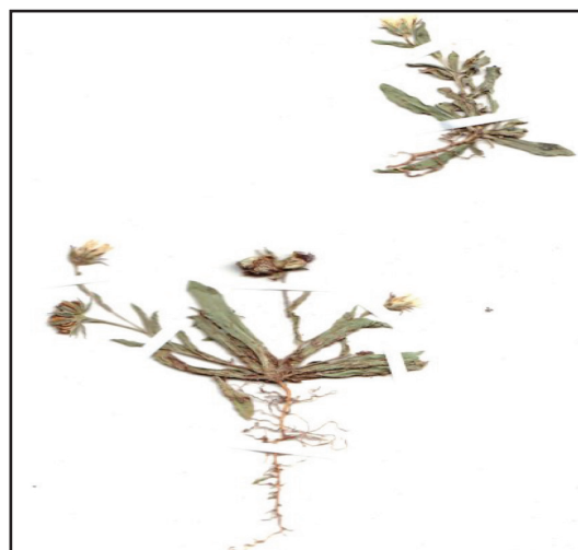
Figure 2. Calendula tripterocarpa

Some studied specimens: Golestan: Kalale towards Morave tappe, 35 km before Morave Tappe, 550 m, Javadi and Ghanbari 31760-IRAN; Kalale towards Morave tappe, Gogjeh, 250 m, Javadi and Ghanbari 31765-IRAN; Kalale towards Morave tappe, Gharehghovakh, 400-600 m, Mussavi and Tehrani 7707-IRAN.- Mazandaran: Kelard, Haraz road, 430 m, Foroughi 4354 (TARI); Kelard, Haraz road, 460m, Foroughi 1382 (TARI).- Fars: