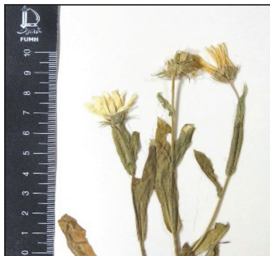
Figure 1. a b. Calendula aurantiaca

Some studied specimens: Kohkiloyeh va Boirahmad: near Dehdasht, 500 m, Assadi