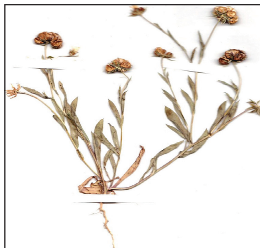
Figure 6. Calendula sancta