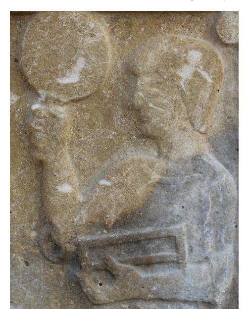
Fig. 3: A detai Grave Stele from Samsun Museum