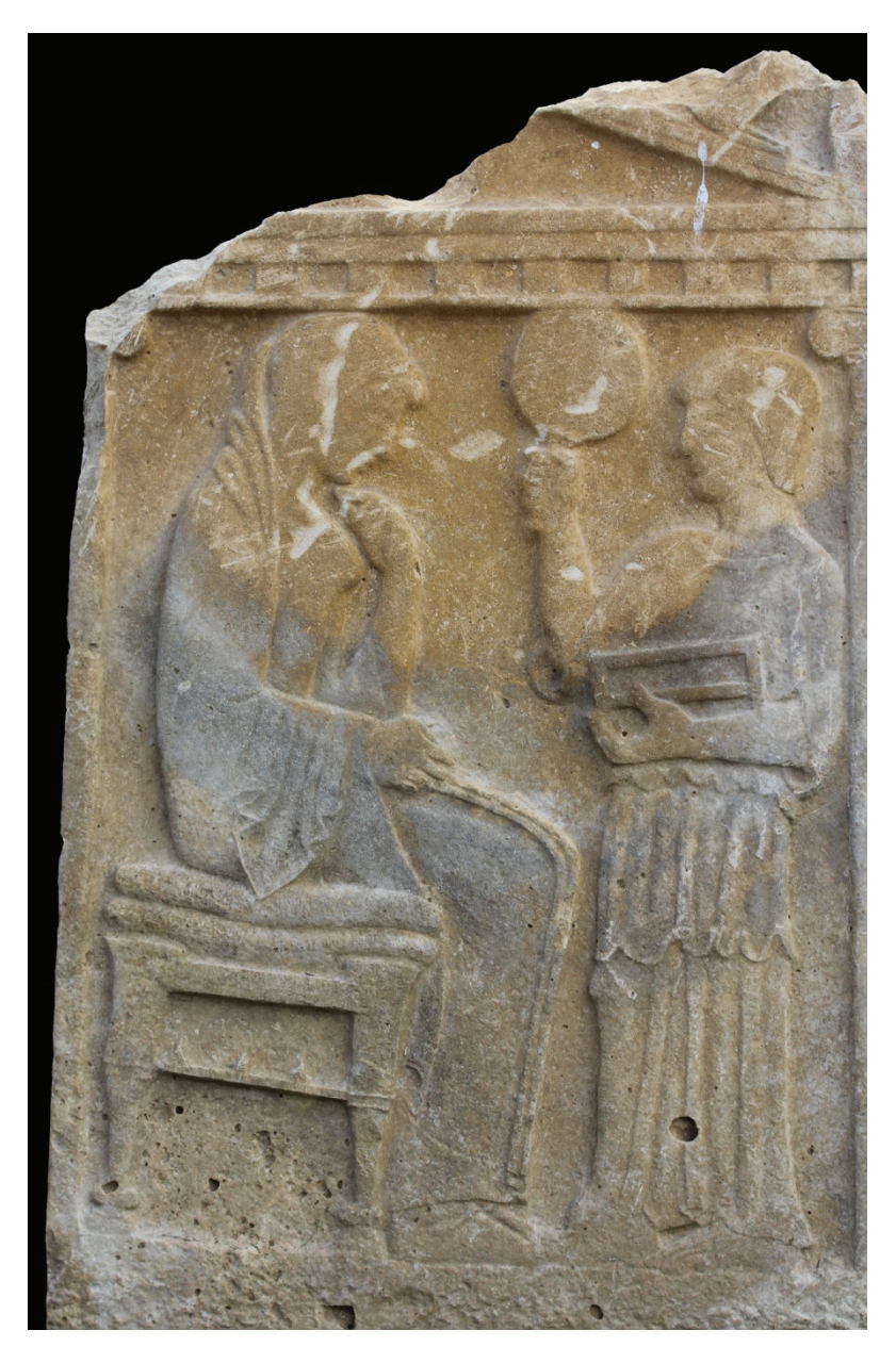
Fig. 1: Grave Stele from Samsun Museum