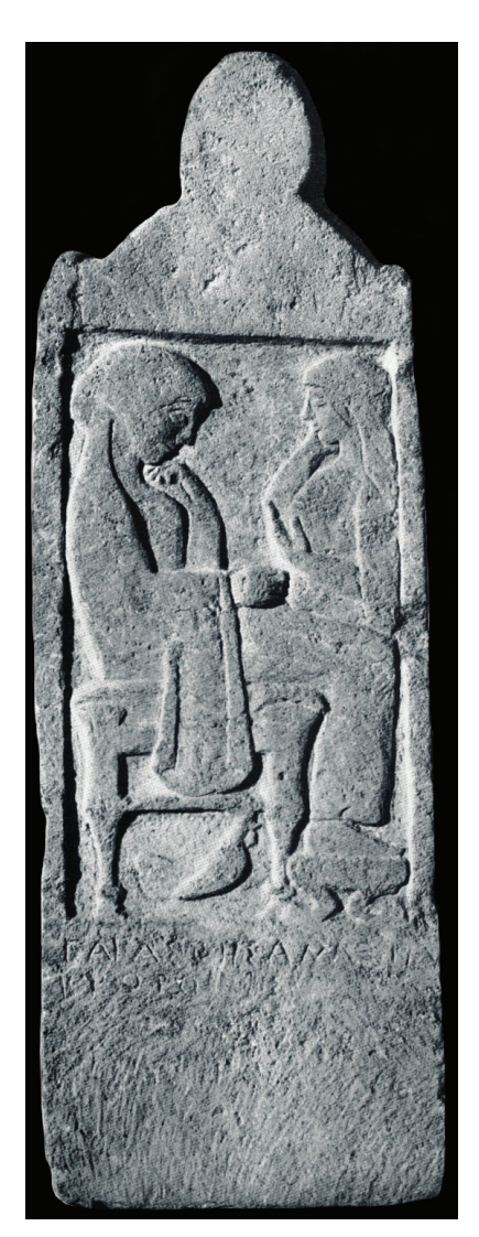
Fig. 5: Grave Stele from Sinop Museum (Akurgal, Zwei Grabstelen, abb. 5)