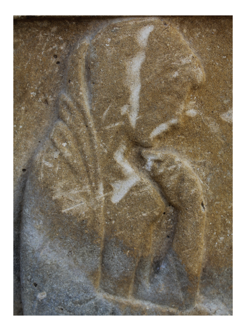
Fig. 2: A detai Grave Stele from Samsun Museum