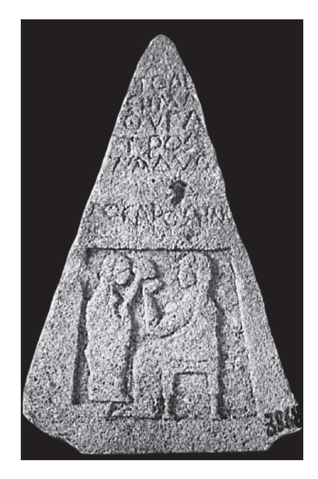
Fig. 6: Grave Stele from Istanbul Archeology Museum (Hiller, ibid. , taf. 11, o-19)