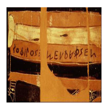
Figure 7: Sophilos' signature: "sofilos me grafsen" ("Sophilos painted me"). British Museum. (Inv. No: 1971,1101.1)

When we look at the poetic tradition of Antique Age, it is seen that one of the two elements that marked the archaic period poetry was individuality. The best example is the world of anthropomorphic gods in the works of Homeros and Hesiod. The world of gods created by Homer and Hesiod caused the human thought to gain independence at an early stage and influenced not only the art but also the ancient Greek philosophy. According to Aristotle, Homer is the first philosopher.