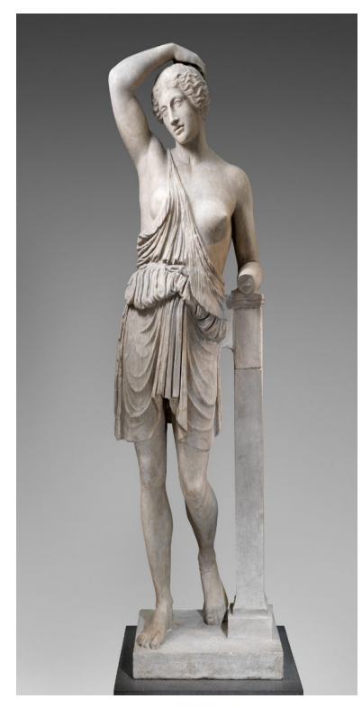
Figure 1. Peplos Kore, Acropolis Museum. (Inv. No: Acr. 679)

techniques and methods. They were very free in pursuing their art compared to an Egyptian artist. The way of thinking of antiquity also pioneered the promotion of free behavior for the artists (Kılıç 2000: 14). For example, Peplos Kore, which is an ancient Egyptian art sculpture, is one of the best examples of Hellenistic and Roman women's sculptures in terms of reflecting how the closed and solid forms of Archaic art under the influence of Egyptian culture were broken. (Fig. 1-2).