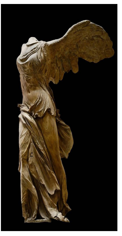
Figure 4. Winged Victory of Samothrace. Louvre Museum (Inv. No: Ma 2369)