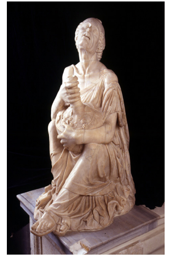
Figure 6. Drunk old woman. Capitoline Museum (Inv. No: MC0299).

Aristotle, who collected his views on art in his work Poetics , is a philosopher who expressed view on aesthetics and art in antiquity and whose views on beauty affected the entire aesthetic world. His views have been taken as a basis by all aesthetists to date, especially in the field of sculpture, and in line with his realist views, he produced the most beautiful works of antiquity. Sculptures made in a realist style in Hellenistic sculptures are among the best examples of this (Fig. 6).