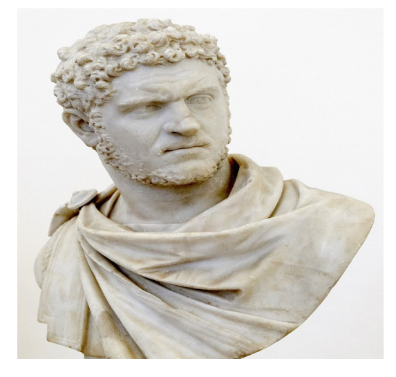
Figure 8. Marble portrait of the emperor Caracalla. Museo Archeologico Nazionale di Napoli (Inv. No: 6033)

The Roman period painting and sculpture is the repetition of Ancient Greece. In this period, the artist is not as free as in the Hellenistic Period and the works of art were not stylistic. In the portraits, we see the novelty brought by the artists of Roman period to art. The portraits of the Roman period have political concern and are full of emotion (Fig. 8).