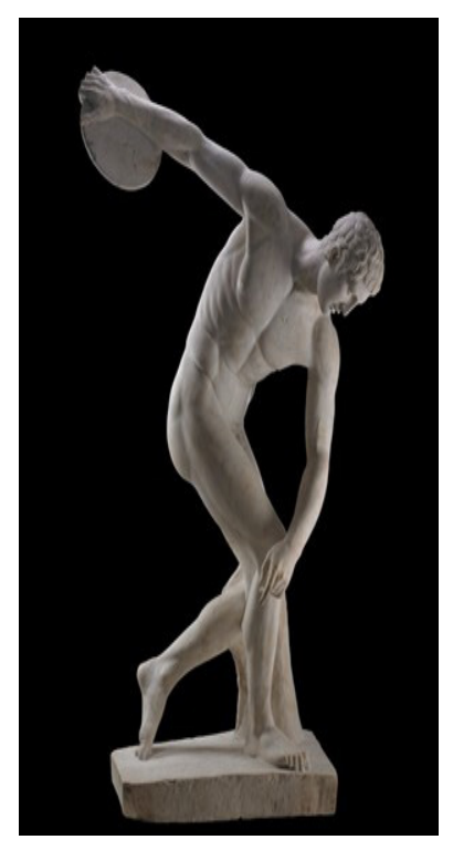
Figure 3. Diskobolus. British Museum. (Inv. No. 1805, 0703. 43)

when this view was being discussed (Fig. 3). This sculpture is an instant snapshot, there is calmness in motion. With this work, the artist moves away from the frontality and begins to make instant changes as he perceives his sculptures. Here, the artist acts more free than in the past. In addition to humanitarian movements, the human emotions begin to enter into the field of sculpture. There is no limit in front of the freedom of movement of the artist other than the limit drawn by the artist's art, taste, criteria and sense of impression (Lechat 1944: 55). Similarly, the sculpture named Samothrake Nikesi is one of the most original examples of the philosophy of capture on the basis of the idea of Protagoras (Fig. 4). The goddess of victory Nike is seen landing on the fore ship (Boardman 2005: 228). This sculpture is a reaction to naturalism and expressionism against the idealism of classical period sculptures. This attitude also shows the freedom of the sculptor.