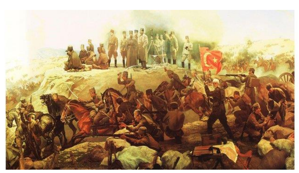
Figure 2. The Turkish War of Independence

Mustafa Kemal Atatürk in 1919. The government had the intention that the liberation of the nation was possible with only the mandate and protection. Besides, some intelligentsias also shared the same ideas, such as Ali Kemal Bey in his newspaper Peyam-ı Sabah (Morning News) . His words were declaratory of his hateful opposition against the ones who waged the Independence War. On the other hand, the occupation attempts of the proxies of the allies were subdued by the significant resistance of which the press was capable. Faik Ahmet Bey and his local paper İstikbal (The Future) began to make considerable contributions to the National Campaign for the Turkish War of Independence by leading up to the resistance and form public opinion in 1918.