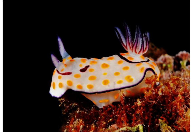
Figure 2. An underwater observation of G. annulatus Coryphellina rubrolineata