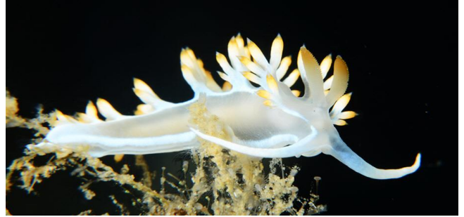
Figure 5. An underwater observation of F. babai

Distribution: It is considered as common species in the Mediterranean Sea. It spreads from the Adriatic Sea to the Atlantic coasts of Spain, Portugal and Senegal. Its first record in the Mediterranean coast of Turkey was given from Levantine coasts [21]. This finding reports its northernmost observation in the Turkish Aegean coasts [Figure 1].