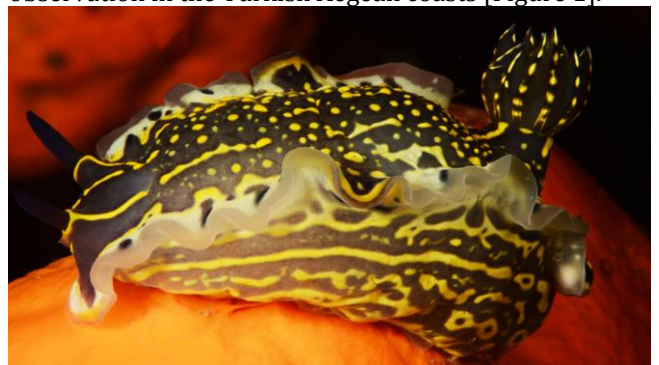
Figure 6. An underwater observation of F. picta

Distribution: F. picta presents the wider distribution area throughout the Mediterranean. Its northernmost report in the Aegean coasts of Turkey was given from Datça [19] This recent data represents its new northernmost observation in the Turkish Aegean coasts [Figure 1].