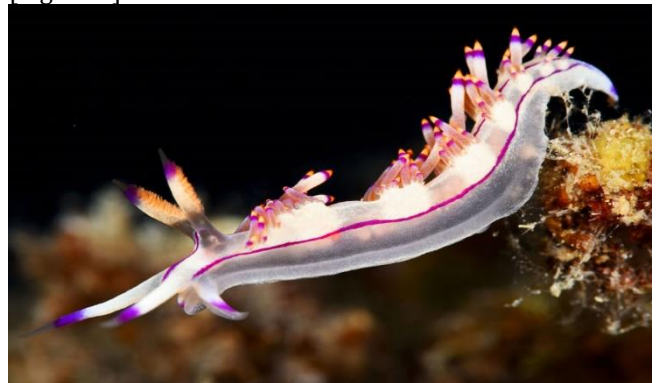
Figure 3. An underwater observation of C. rubrolineata Felimida luteorosea

Distribution: C. rubrolineata is common in the Indo-Pacific regions. It is first reported from Israeli coast [14]. Thereafter, it is reported from Levantine Sea [15,16] and then it has established populations throughout the and Aegean coasts [17,18] This observation represents its northernmost observation in the Turkish Aegean coasts [Figure 1].