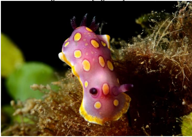
Figure 4. An underwater observation of F. luteorosea

Distribution: It spreads along with the western sectors of Mediterranean and nearby Atlantic coast of Spain and Portugal. Its first report of Aegean and Levantine coasts in the Turkey were given by [19,20] respectively. This observation provides its northernmost observation in the Turkish Aegean coasts [Figure 1].