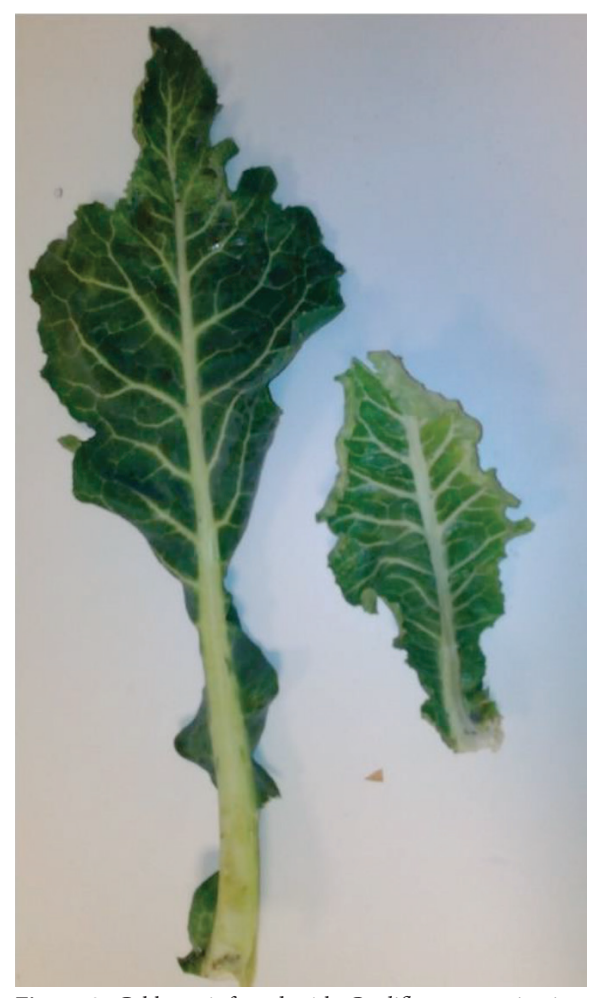
Figure 2. Cabbage infected with Cauliflower mosaic virus (leaf deformation and systemic mosaic symptom)