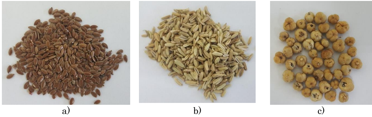
Figure 1. Flax seeds (a), fennel seeds (b), harmful seed capsules (c)

To determine of size dimensions such as length, width and thickness of the flax seeds and fennel seeds, the length (height) and diameter for harmful seed capsules, one hundred seed samples were randomly selected, and size dimensions were measured at an accuracy of 0.01 mm using a dial-micrometer. Some physical properties flax seeds, fennel seeds, and harmful seed capsules such as the arithmetic mean diameter ( D_a ), sphericity ( \Phi ), geometric mean diameter ( D_g ), and volume ( V ) were determined presented by Mohsenin (1986).