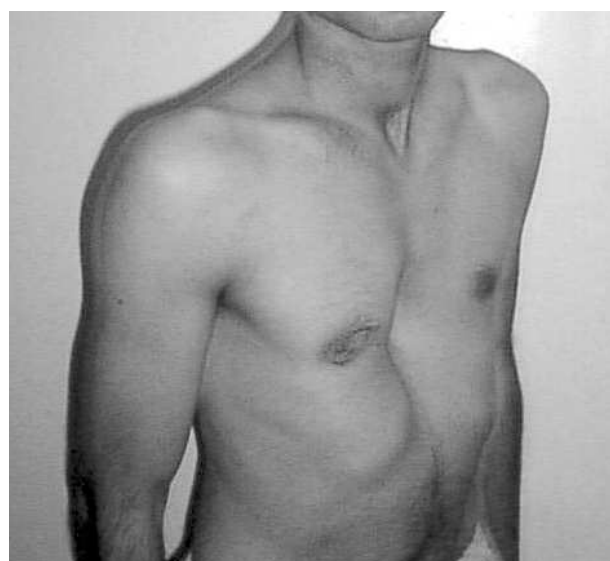
Figure 1: Preoperative photo of a patient with pectus excavatum

We used retrosternal metallic support (retrosternal bar) in 26 out of 38 patients for sternal fixation since January 1998. Sternum was reshaped and osteotomy line was sutured by vicryl and sternum was supported by metallic bar under the sternum. Retrosternal bar was secured with pericostal non-absorbable