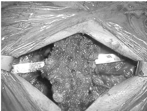
Figure 2: Intraoperative view demonstrating the usage of classical pectus bar during the repair of pectus excavatum deformity

There was no perioperative death. Early postoperative complication did not occur in any patients. There was no superficial wound infection or no necrosis because of insufficient sternal vascularisation. No patient required blood transfusion. Pe-