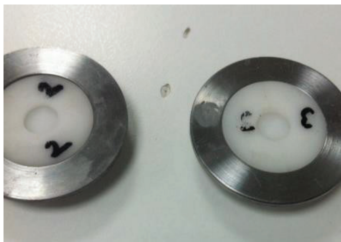
Figure 1. Teflon mold for composites specimens.

Surface roughness of different composite resins was determined using the roughness average (Ra) parameter, which represents the arithmetic average of absolute values