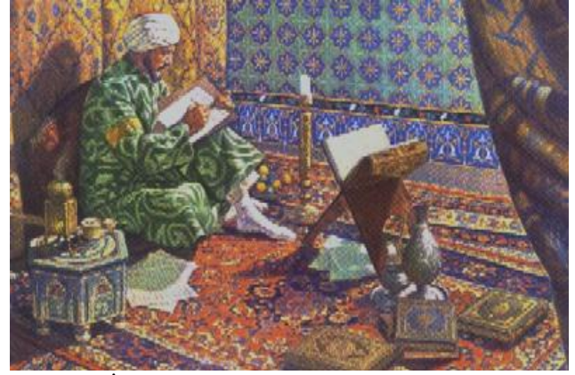
Picture 2. İbn-i Sina

One of the followers of Hippocrates, Aesclepiades from Ancient Rome, distinguished between delusion and hallucinations, espoused music therapy, and opposed bleeding and imprisonment as treatments. Another noted pioneer in the development of medicine and psychiatry is Galen extended Hippocrates' doctrine of the humors to personality and predisposition to mental disorder, and separated emotional causes from medical ones.