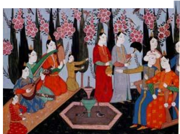
Picture. Ottoman Music Therapy

The history of mental health in Anatolia starts with Asklepieion Temple, which is thought to be the first mental hospital in the world, continues with Darülşifas and Bimarhanes during the Seljuk and Ottoman Empires extending all the way to the contemporary mental hospitals in the Republic of Turkey.