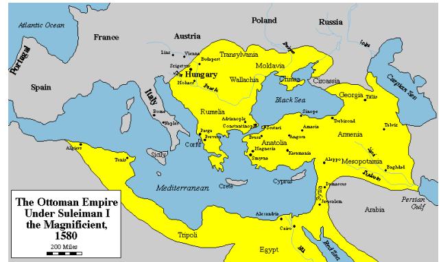
Picture 4. The Ottoman Empire

Medicines were made on location and distributed for free. In these places psychiatry and medicine was combined and psychological service was given to the medically ill.