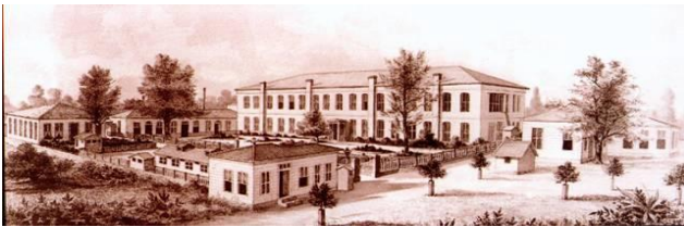
Picture 5. GATA Hospital