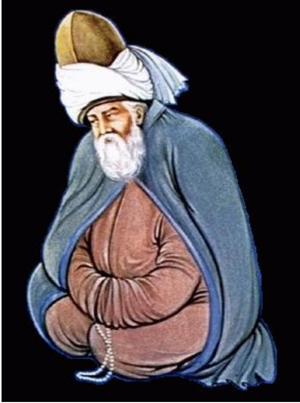
Picture 1. Mevlana

In contrast, the mentally ill in the west at that time were generally feared and were ostracized from society. This stigma of mental illness was not seen in among the peoples of Anatolia with whom the Turks would intermingle centuries later. The mentally ill were protected and treated kindly as early as the 1 st century. The stage had been set in pre-Islamic days of Anatolia. Medical pioneers such as Hippocrates (460-177 BC) and Galen (121-201 AD), who have continued to be influential in the development of medicine and psychiatry today, lived in Anatolia during the Hellenistic Era.