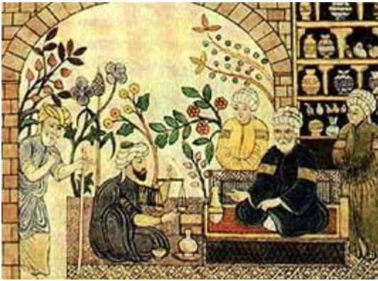
Picture 3. Gevher Nesibe Hospital 1

The contributions of the philosophy and accumulated learning on the development of Turkish psychiatry up to and including the Seljuk period are outstanding examples of the way in which Turks were able to combine traditional belief systems and rituals with the expanding input of Islam to come up with unique and effective ways of dealing with the mentally ill. During the Seljuk period in what is considered the medieval age in Anatolia "houses of healing" were common. What characterized these institutions were the integration of mental and physical care. One example of this is the Gevher Nesibe Şifahanesi. Moreover, social welfare institutions and hospitals became widespread. Health care services were provided in caravanserai, where people traveling long distances from one place to another could stop and receive food, shelter, and medical assistance, too. Foundations were set up, as well, by the state to carry out these kinds of services. As a consequence of state policy, medical care facilities were found throughout the empire. Care was provided to all members of the empire without regard to religion, language, or race.