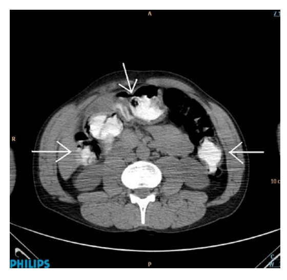
Figure 2: Hyperdense appearance of cocaine packages at gastric antrum (down arrow), ascending colon (right arrow) and descending colon (left arrow).

appeared well with the exception of mild pain in the epigastrium and slight abdominal distention. His vital signs were: blood pressure 140/70 mm Hg, heart rate 81 beats per minute, respiratory rate 17 breaths per minute, and temperature 37.1°C. The only significant physical epigastric finding was mild tenderness. Cardiopulmonary, rectal examinations and electrolytes, complete blood count, liver enzymes were all within normal limits. After the absence of drug intoxication symptoms, we decided to perform a non-contrast abdominal CT scan. CT findings showed the presence of more than thirty rounded foreign bodies striking from stomach to rectum (figure 1-4). At the fallowing the patient admitted that he has swallowed packages of cocaine. Stomach was full of with irregular oval shaped hyper-dense packages (figure 1). These ovular hyperdense opacities are surrounded by a thin line of air (figure 1). The density of powder in the packets was measured about 200HU which is similar to oral CT contrast. The additional drug packages were identified