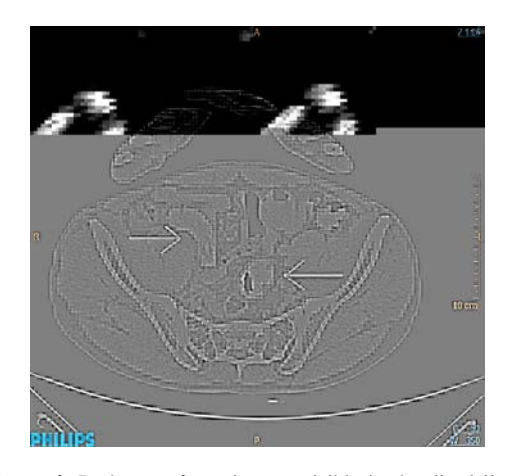
Figure 4: Packages of cocaine are visible in the distal ileum (right arrow) and sigmoid colon (left arrow).

in the colon and distal ileum (figure 2-4). The CT scan showed no radiological signs of intestinal obstruction.