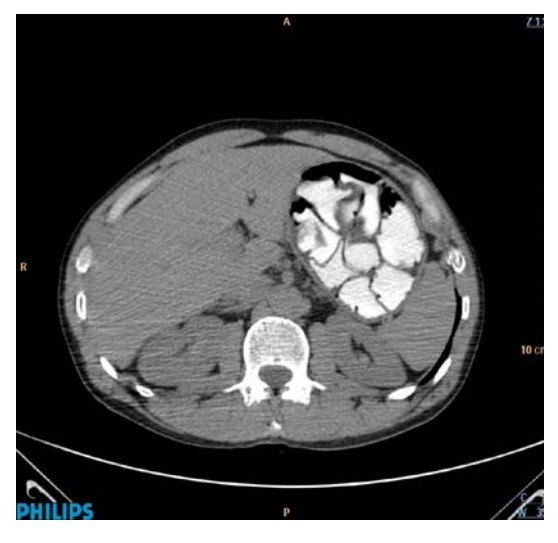
Figure 1: Axial CT scan shows that the lumen of the stomach is full of irregularly shaped hyperdense foreign bodies surrounded with a narrow and sharp hypodense boundary that contains air.