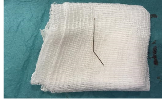
NEEDLE BREAKAGE DURING DENTAL ANESTHESIA IN THE MAXILLA: REPORT OF A CASE AND LITERATURE REVIEW