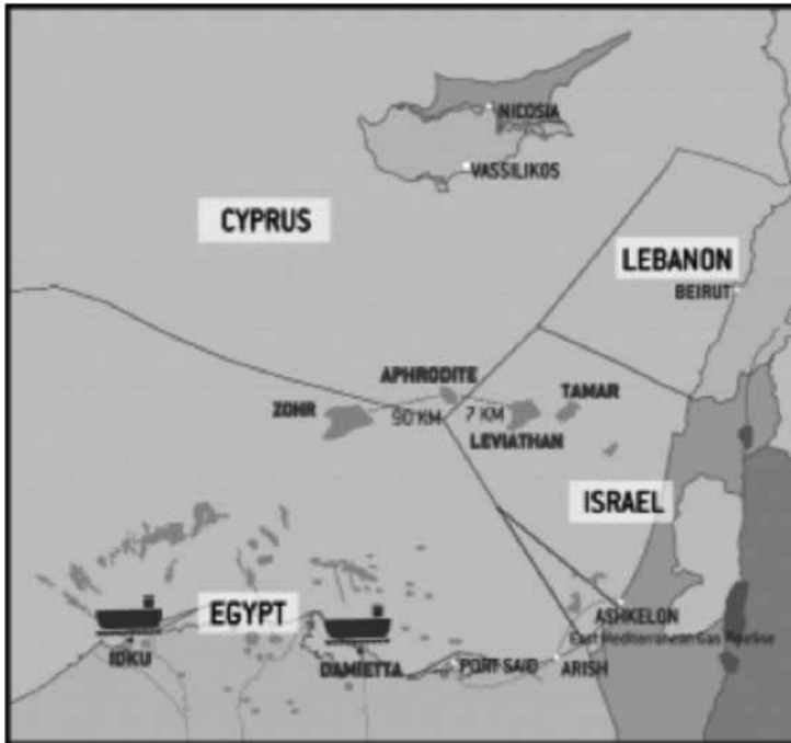
Figure 3: Egypt's Zohr Field