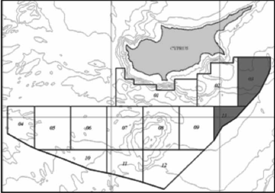
Figure 2: Off Shore Hydrocarbon Exploration Blocks Claimed by the Greek Cypriot Administration