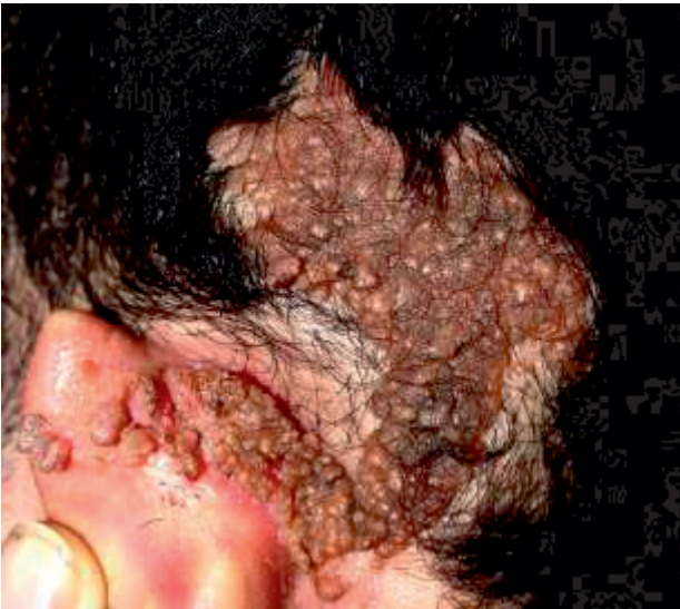
Figure 1: A 10x5 cm pale-yellow verrucous plaque devoid of hair on the left post-auricular part of her scalp

A 19-year-old healthy man presented with a new verrucous papules in a previously asymptomatic lesion that had been present on his left postauricular scalp since birth. The patient had no previous history of cutaneous or internal malignancies, and complete review of systems was negative. Physical examination of the scalp revealed a 10x5 cm pale-yellow verrucous plaque devoid of hair on the left post-auricular part of her scalp extending to the posterior part of auricula. Within this lesion there were multiple small (1–2 mm in diameter) verrucous firm nodules and multiple papillomatous lesion 2-4 mm in diameter (Fig. 1). There was no local or regional lymphadenopathy. Complete skin and lymph node examinations were otherwise unremarkable. Complete excision of the entire plaque was performed. Histopathological examination revealed the piece of skin to include a large papillomatous component that was related to hyperplasia with underlying sebaceous glands and prominent apocrine glands (Fig. 2). These are the features characterizing a sebaceous naevus. NS is considered as malformation with epidermal follicular, sebaceous and apocrine gland components (1). A wide variety of benign and malignant tumors have been described in association with nevus sebaceous. Syringocystadenoma papilliferum and trichoblastoma are the most common benign tumors associated with NS (2).