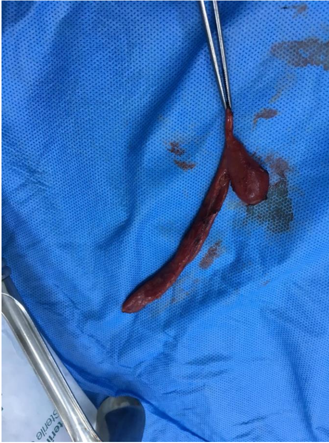
Figure 2: Intraoperative imaging of gallbladder duplication in Case 1