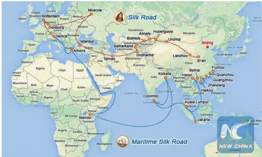
Figure 2. One Belt One Road Map