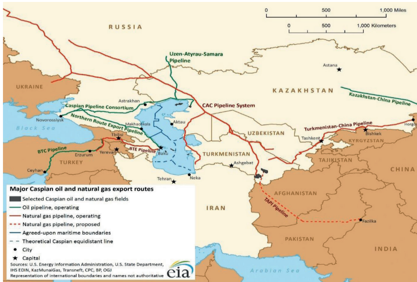
Figure 3. Oil and Natural Gas Pipelines in Central Asia

portant in meeting China's energy demand.