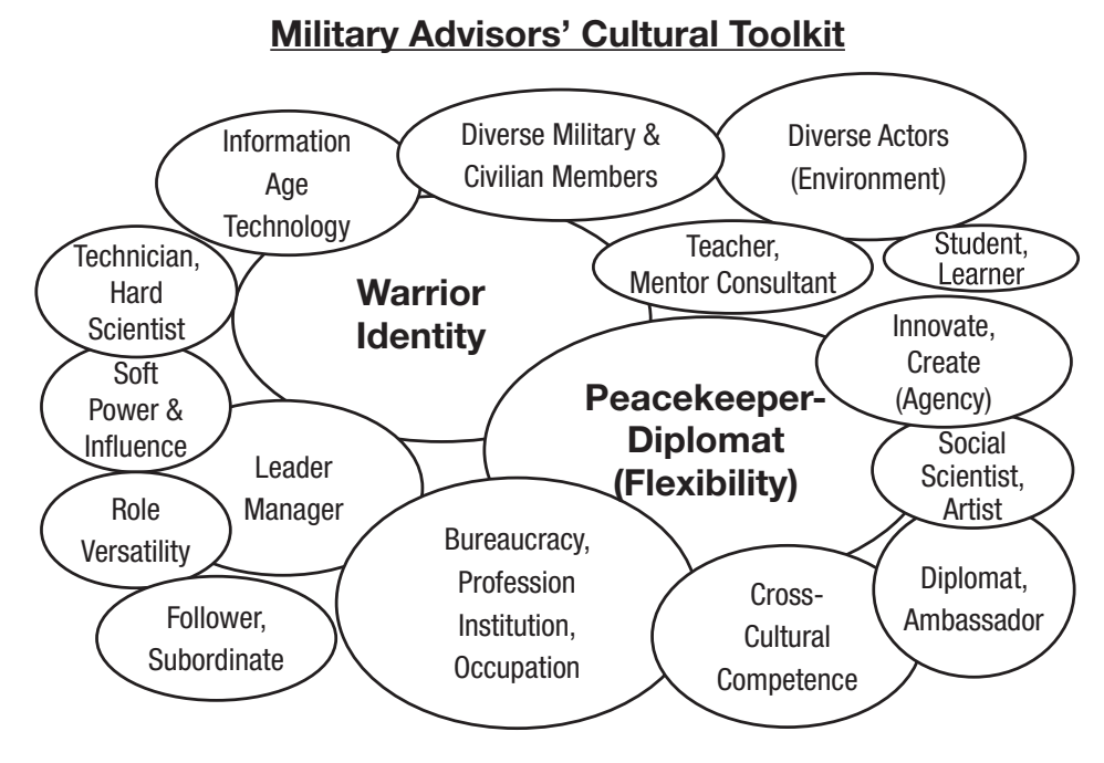
Figure 4: Military advisors' cultural toolkit.

This project supports the thesis of the emergence of a postmodern military culture (Figure 2), and the similar concept of the advisory cultural toolkit (Figure 4). The advisory toolkit draws heavily on the peacekeeper—diplomat sphere and associated cultural spheres; these tools empower advisors to advance their missions. The military advisor cultural toolkit provides the organization sufficient conceptual space and flexibility for the development and coexistence of seemingly oppositional but vitally necessary cultural spheres, such as the warrior and peacekeeper—diplomat cultural toolsets (Figure 4), in the military's culture. The advisor cultural toolkit bears a strong resemblance to postmodern military culture, but the