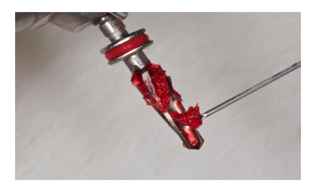
Figure 2. Autogenous graft collected with LDWI technique.

Once the implant site had been prepared, the selected implant was inserted in the site by means of a carrier piece. All implants in the study were positioned at bone level or 1mm below the bone level. As we preferred a two-stage dental implant placement method, first the closure screws were inserted and then the wound edges were primarily closed with 4.0 propylene sutures (Doğsan, Istanbul, Turkey) to cover the implant head. All these surgical procedures were performed by a single surgeon for the standardization of treatments.