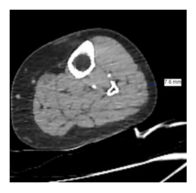
Figure 1. Subcutaneous tissue thickness of the calf region.

section thickness of 0.625 mm. All measurements were taken from the left leg (Fig. 1,2).