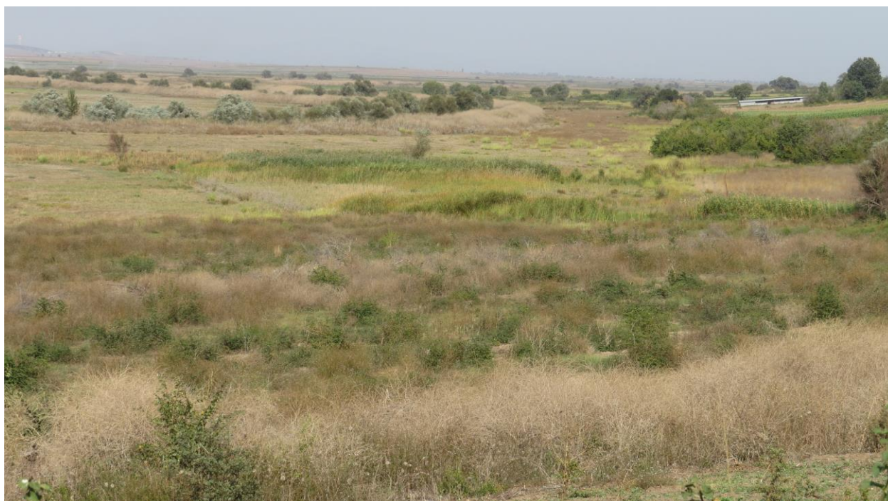
Figure 3. Habitat of Proboscidea louisianica

The leaves, stems, flowers and immature fruits of P. louisianica are covered with dense glandular trichomes, and that exude unpleasant smelling oily materials. The glandular trichome exudate on leaves of P. louisianica were the most abundant constituents the dammarane triterpenes (47%) and the glucosyloxy-fatty acids (38%) (Asai et al. 2010).