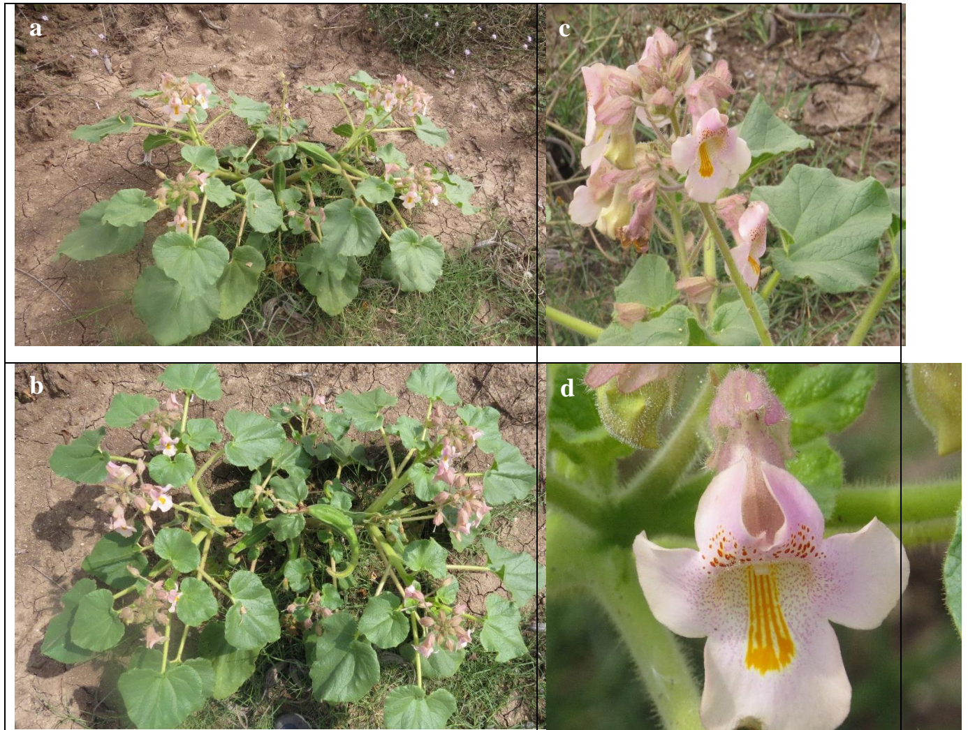
Figure 2. Proboscidea louisianica ; a,b: habitus, c,d: flower morphology

P. fragrans (Lindl.) Decne. which is taxonomically similar to P. louisianica has been accepted as a species according to Lawrence 1957 and Hevly 1970 (Gutierrez 2014). The leaves of P. louisianica have entire margins, and the corollas are creamy-white tinged with lavender whereas leaves of P. fragrans are 3-5 lobed with roughly serrate margins and the corollas are dark-medium purple. However according to Bretting (1983), P. fragrans was accepted as a subspecies of P. louisianica . According to recent molecular studies using phylogenetic analyses of nuclear and chloroplast sequences fails to place P. fragrans as a sister to P. louisianica . Thus these species were recognized to be different species (Gutierrez 2011, 2014).