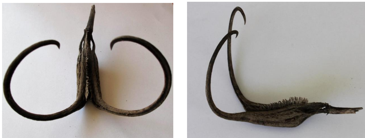
Figure 4. Mature capsule of Proboscidea louisianica

There is no common name of the species in Turkish because of the new registration for Flora of Turkey. “Keçibaşı” is suggested Turkish name for this species as the translation of one of its names used in English which refers to the long horned fruit that resembles goat-head (Figure 4).