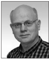
Gustav F. Jirikowski

proof-of-principle that excitotoxicity mediates injury to white matter during stroke. Using a structure-to-function approach, she identified that the unique but unexpectedly complex mechanisms of white matter injury significantly differ from neuronal injury. Her studies therefore challenged the existing convention in stroke research that a common mechanism of injury exists in the brain and provided experimental evidence underlying the failure of clinical stroke trials exclusively focused on neuronal protection. Currently, she is interested in the role of protein acetylation and mitochondrial dynamics in white matter stroke, which has expanded her interest to neurodegenerative diseases involving white matter such as multiple sclerosis, Alzheimer's disease, traumatic brain injury. She is recipient of multiple grants from NIH and other agencies such as the ASA.