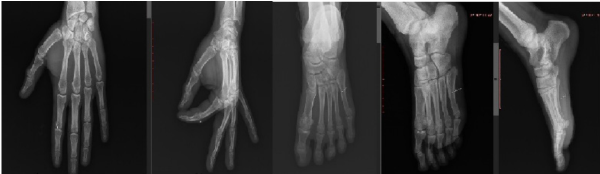
Figure 2. 10-year-old patient with glass in left foot. Glass piece was removed under local anesthesia and patient was discharged in the same day.

B. 13-year-old patient with left foot needle injury. Needle was successfully removed and patient was healed without any complication