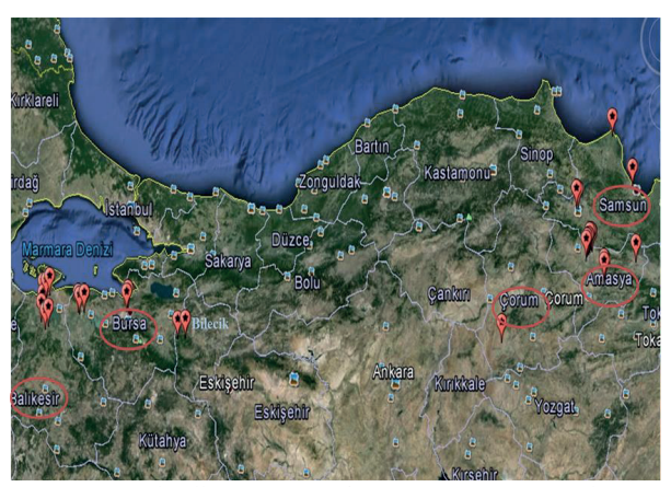
Figure 1. Seed collection sites of Sinapis arvensis in Türkiye

germination, S. arvensis seeds of each population were placed in Petri dishes 9 cm in diameter with a double layer of moistened blotting paper and placed in an incubator at +22 °C with a 12/14 light period. The germinated populations were transferred to pots and grown in sterile soil in a greenhouse under controlled conditions. For further research, 30 populations were selected (11 from Amasya (AMS-1, AMS-2, AMS-3, AMS-4, AMS-5, AMS-6, AMS-7, AMS-8, AMS-9, AMS-10, AMS-11) 4 from Samsun (SAM-1,- SAM-2, SAM-10, SAM-12) 1 from Çorum (ÇOR-1) 5 from Bursa (BUR-1, BUR-2, BUR-5, BUR-9, BUR-10) 7 from Balıkesir (BAL-1, BAL-2, BAL-3, BAL-4, BAL-5, BAL-6, BAL-7) and 2 from Bilecik (BİL-1, BİL-3)) (Figure 1).