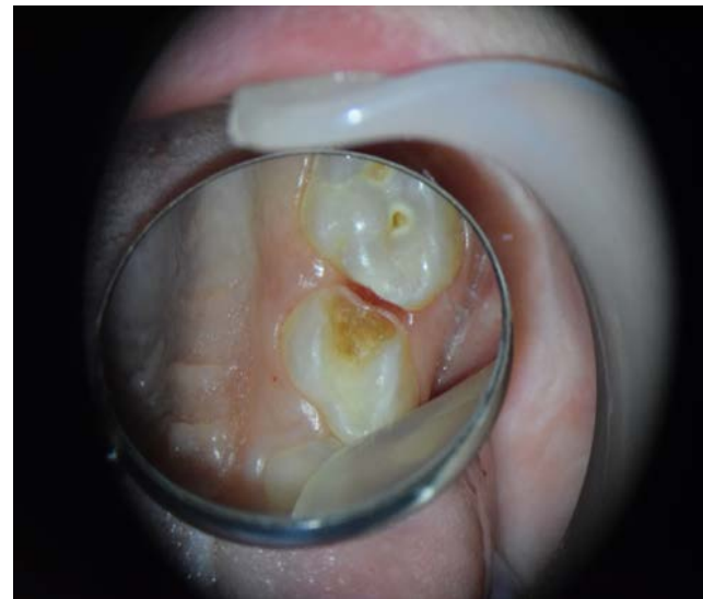
Figure 2. Photograph of an approximal carious lesion of a maxillary first left primary molar made with DOM at magnification 8x. Presence of partially infected dentine at the bottom of the cavity that may be preserved.

The consistency of the partially infected dentin was assessed as averagely hard in all clinical cases studied – with code 3 (moderately hard dentin offering light resistance during probing under the Bjørndal et al. <sup>22</sup>) (Fig.2).