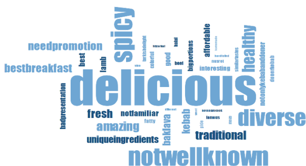
Figure 1: Word Cloud Representation of Participants' Expressions About Turkish Cuisine

The word that attracts attention in the table are the expressions "not well known" (n: 27) and "need promotion" (n: 12). Based on these words, the participants think that Turkish cuisine is not promotion enough.