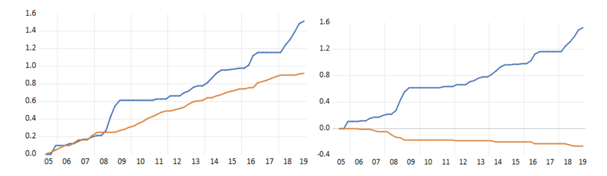
Figure 2: Unemployment<sup>+</sup>-GDP<sup>-</sup>