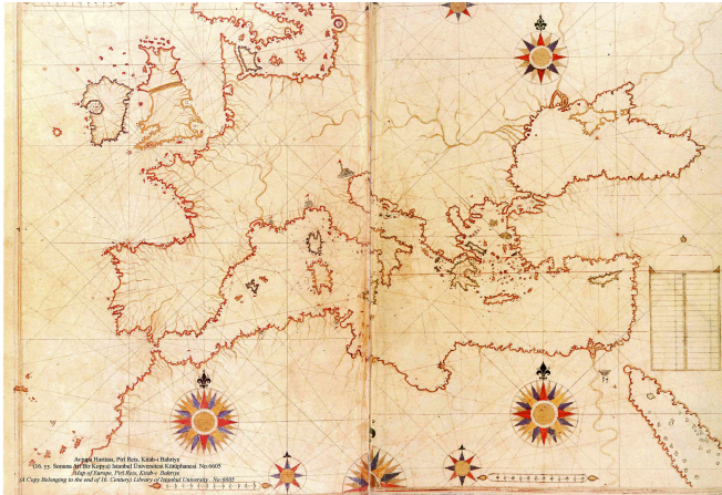
Figure 1. Piri Reis map of the seas of the Old World

These notes speak of Indian Ocean and China Seas, implying that there was also a second part of the map that was unfinished or lost (Hagood 1996; Ülkekul 2009). A second map of the new world updated in 1528, of which only a small piece survives today, depicted details of Labrador, Newfoundland, Florida, central America with Cuba and some other Caribbean islands.