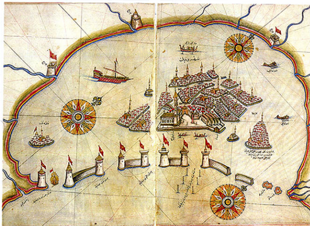
Figure 2. Map of Venice Lagoon from 'Kitab-ı Bahriye' of Piri Reis

These notes speak of Indian Ocean and China Seas, implying that there was also a second part of the map that was unfinished or lost (Hagood 1996; Ülkekul 2009). A second map of the new world updated in 1528, of which only a small piece survives today, depicted details of Labrador, Newfoundland, Florida, central America with Cuba and some other Caribbean islands.