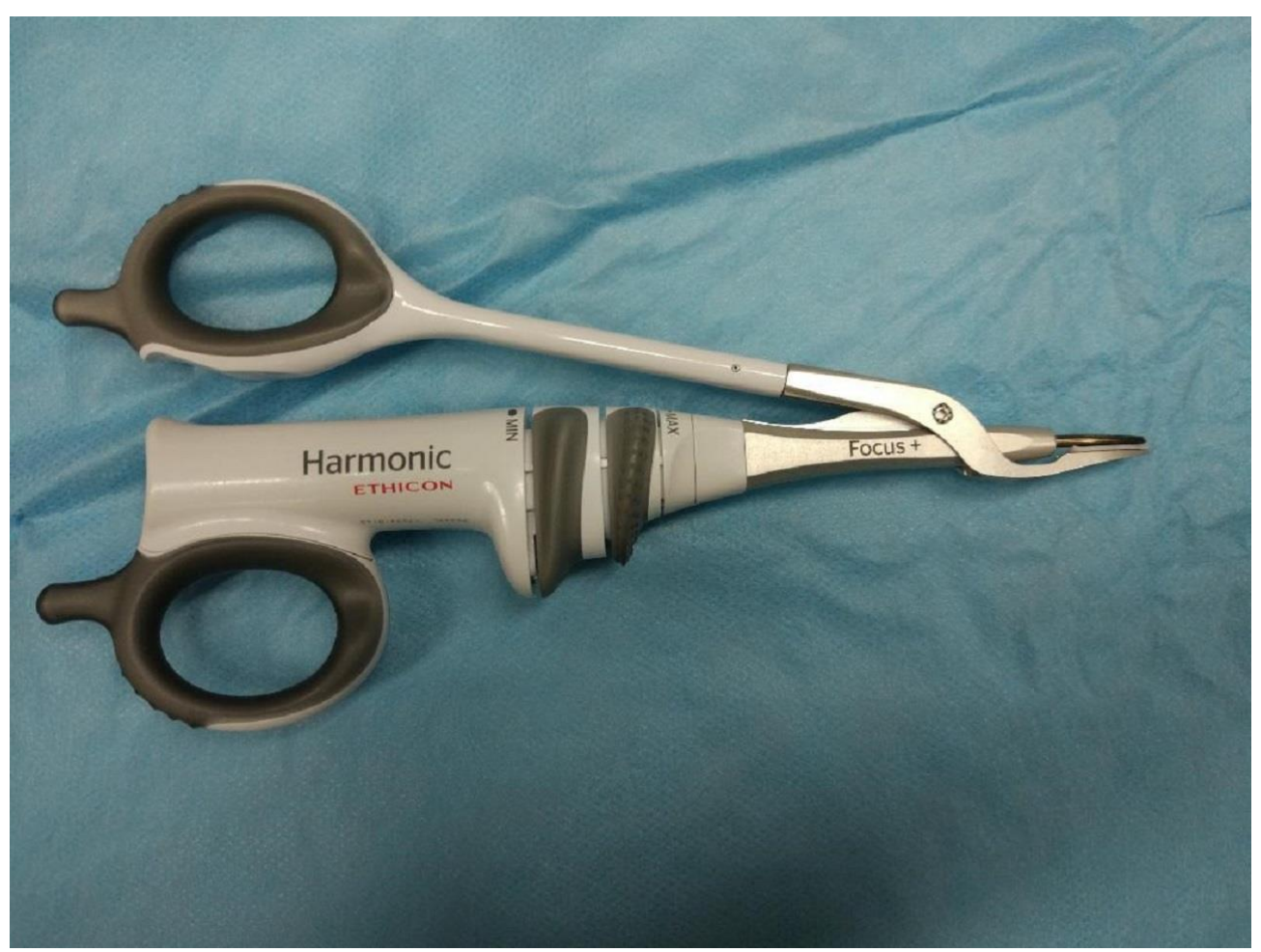
Figure 1. The 5 mm curved sharp scalpel harmonic scalpel tip (Ethicon Endo Surgery Inc., Cincinnati, OH)

5.39\pm0.73 (min:3 max:6) in the BPG and 3.95\pm0.74 (min:3 max:5) in the HSG and this differences were significant statistically (p<0.05). When the pain scores of the postoperative 7th day were examined, it was 4.23\pm0.87 (min:3 max:6) in the BPG and 3.63\pm0.61 (min:3 max:5) in the HSG and at the 10th day it was 3.21\pm0.92 (min:2 max:5) in the BPG and 2.84\pm0.59 (min:2 max:4) in the HSG this differences were not significant statistically (p>0.05) (Table 1) (Graphic 1).